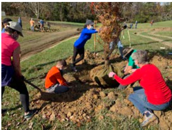
Volunteers planting native, pollinator-friendly trees along a stream in Carrboro's Henry "Hank" Anderson III Community Park in November 2020

In August 2020, Town staff received a grant from the North Carolina Urban Forest Council's Legacy Tree Fund to plant native pollinator-friendly trees and shrubs to restore the riparian buffer of an intermittent stream in the Town's Henry "Hank" Anderson III Community Park. In November, the Town organized a volunteer tree planting event with 50 volunteers to plant trees along the stream and in several additional areas throughout the park. At the event, all volunteers wore masks and followed additional COVID-19 precautions. Staff also provided volunteers with a presentation about the importance of native riparian buffers and their role to help manage stormwater flow, reduce erosion, sequester carbon, improve water quality, and provide habitat for wildlife and native pollinators. Staff also worked to install erosion control materials and seed the entire riparian area using a native pollinator-friendly seed mix. In addition, the Town held invasive species volunteer removal events in January and February 2020 to remove invasive vines such as wisteria and English ivy from Carrboro's Wilson Park in order to improve habitat for native species. Beginning in March 2020, in order to follow precautions to prevent the spread of COVID-19, the Town held smaller volunteer events in with 3-4 volunteers each month to continue removing invasive species in Wilson Park.