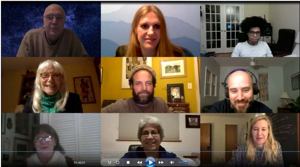
Members of Carrboro's Bee City USA Committee, the Environmental Advisory Board, at a virtual meeting. Environmental Advisory Board members met virtually starting in May 2020 due to the COVID-19 pandemic.