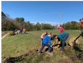
Volunteers planting native, pollinator-friendly trees along a stream in Carrboro's Henry "Hank" Anderson III Community Park in November 2020