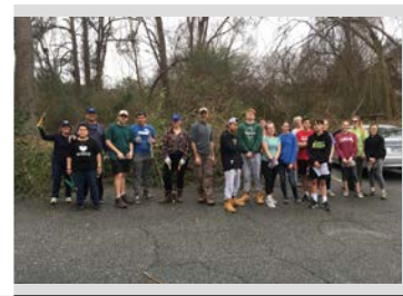
Volunteers Standing in Front of Invasive Vegetation Removed from Carrboro's Wilson Park in January 2020.