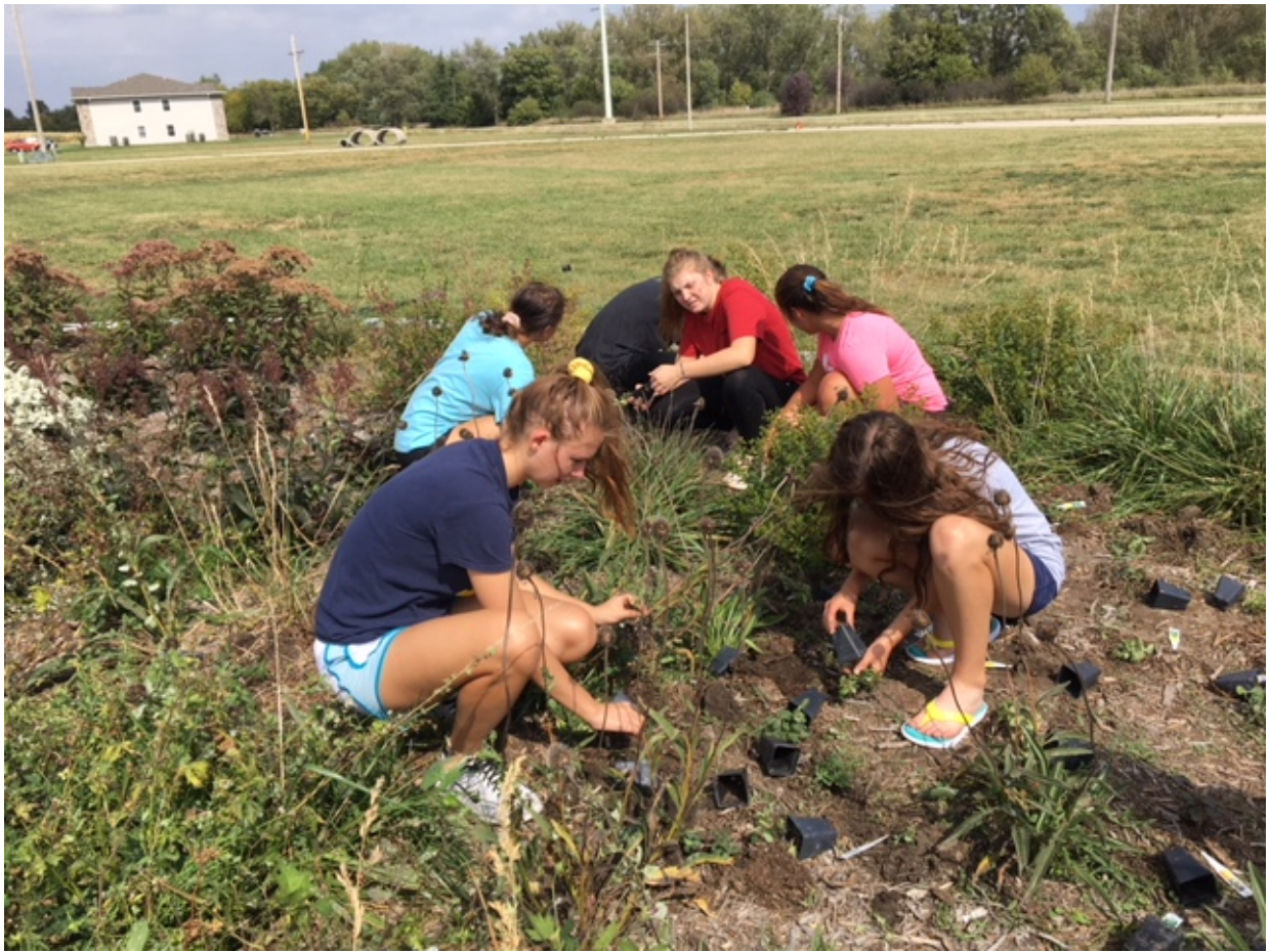
Living mulch (weed shield) being planted by CCC students in Grand Island pollinator garden.