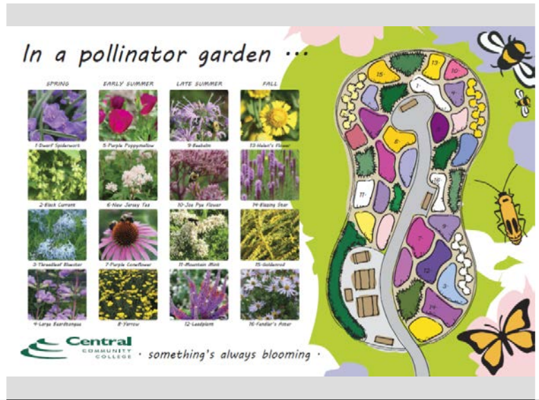
Grand Island pollinator garden color coded blooms map sign