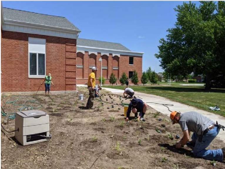
Socially distanced volunteers plant a new pollinator garden in Hastings after a demonstration by the Nebraska Statewide Arboretum June 22, 2020

through planting days to allow adequate air flow and distance during the pandemic. There was a planting day for the Ord garden expansion, the new Hastings pollinator garden, and tree planting in Hastings.