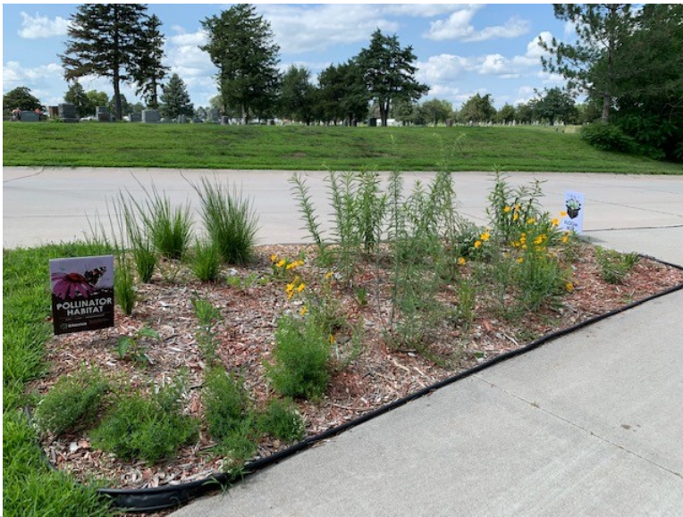
A small pollinator habitat sign is displayed in the Ord, Nebraska pollinator garden.