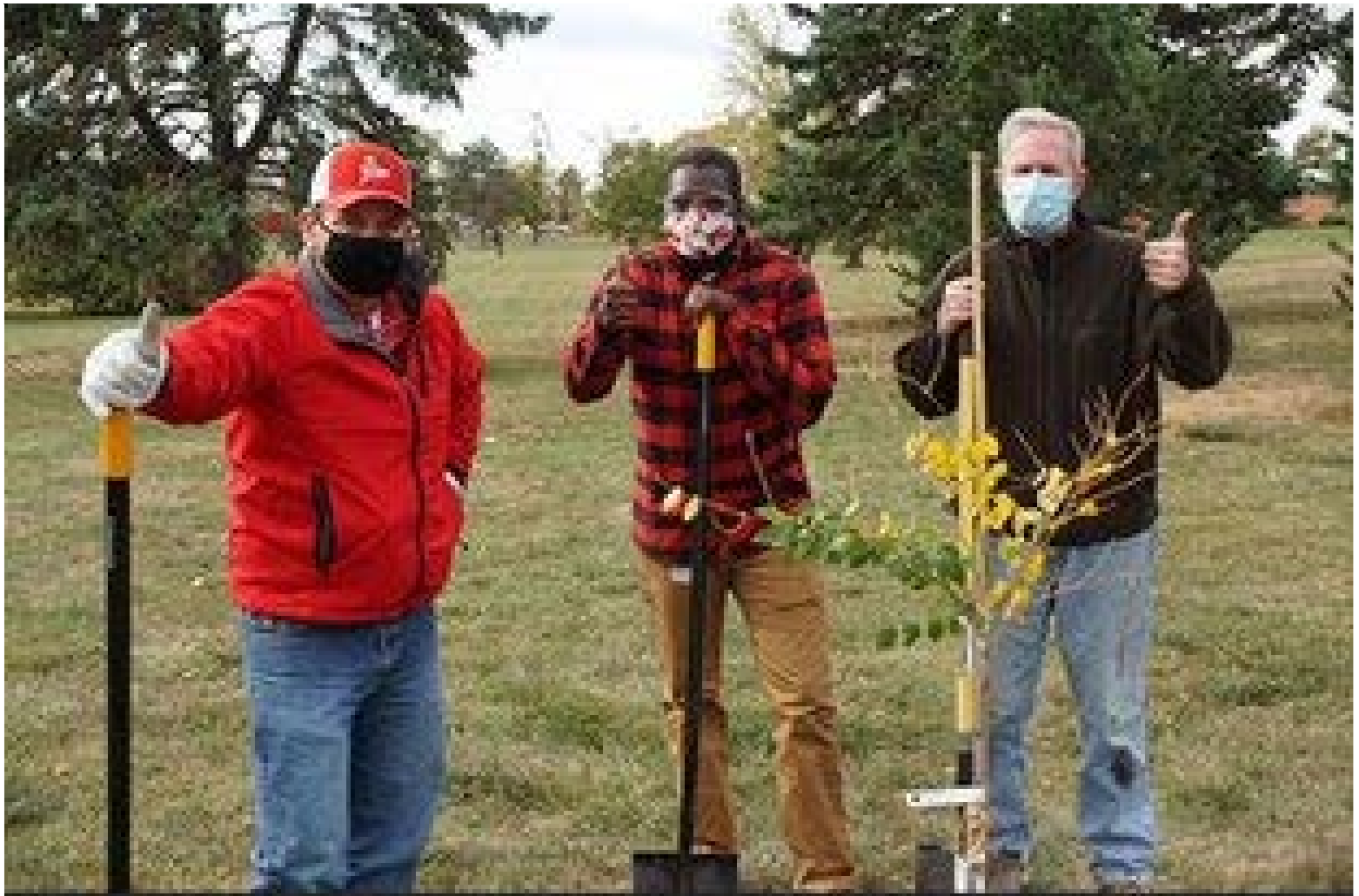
Three staff volunteers at the Hastings campus tree planting day give the camera a thumbs up.