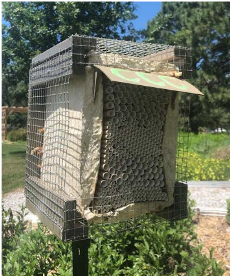
A Bee MycHotel is mounted in the Columbus Pollinator garden offering nesting habitat for native cavity dwelling bees and wasps.