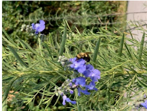
Bee in new Ord, NE garden