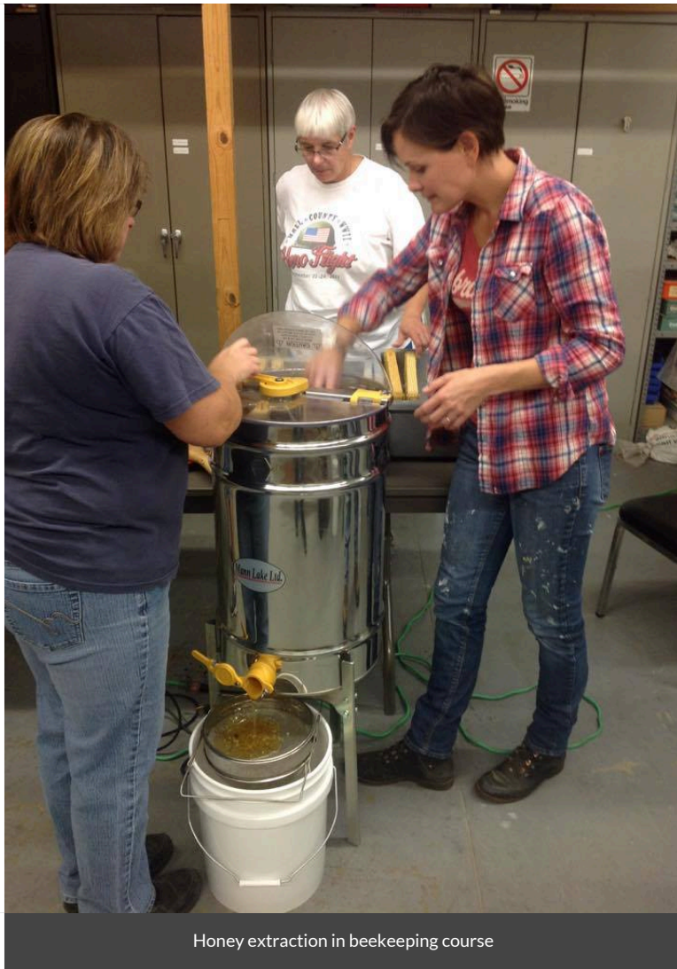
Honey extraction in beekeeping course