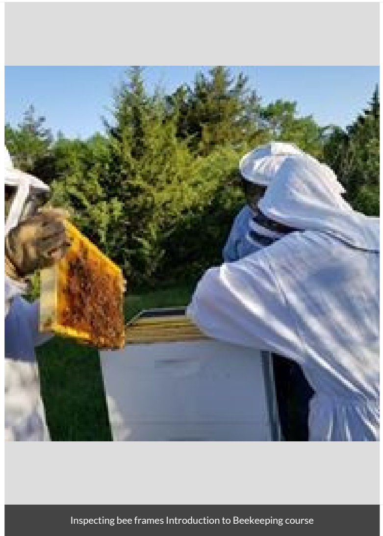
Inspecting bee frames Introduction to Beekeeping course