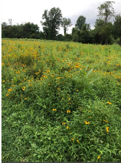
Rockburn Meadow - Full Bloom August 2020