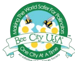
Mayor Sykes signs Pollinator Appreciation Week Proclamation for 2020 and beyond (3rd full week in June).

The 3rd Annual Pollinator Appreciation Day in Mountain Home will be held on June 25 and features a 4 km scavenger hunt (approximately the maximum foraging distance of a bee) with stops at four locations. Contact the UI Extension office at elmore@uidaho.edu for more information.