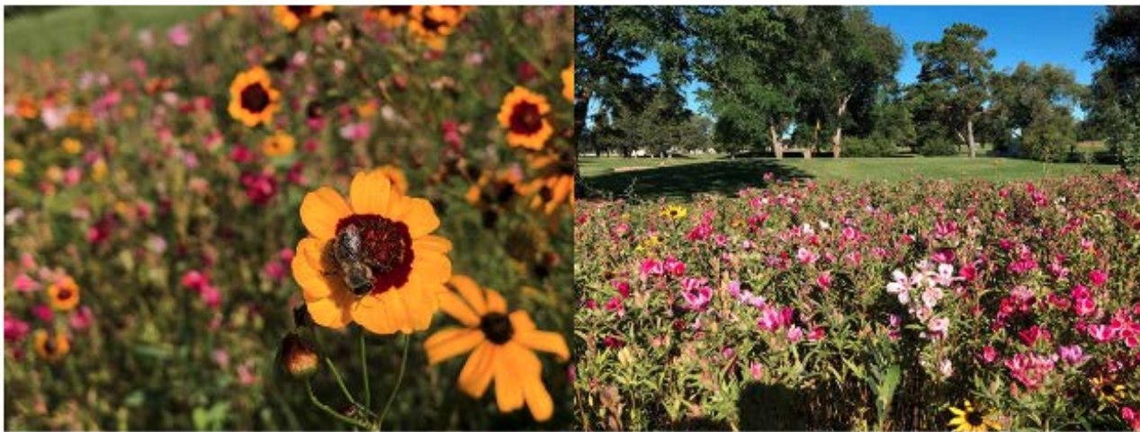
Communication from City of Mountain Home – showing the planting of wild flowers at the golf course in 2020.