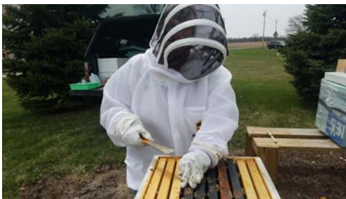
Checking on bees.

Unfortunately, due to COVID - 19, the OCC - Findlay campus was not able to hold our Spring Fling and Fall Fest in which we promote our bee-hives and community garden. Hopefully, depending on the situation with COVID-19 and the status of students returning back to campus there will be a Fall Fest in 2021 and hopefully a large Spring Fling celebration in 2022. We had few people present when we put in some new boxes of bees. We also build shelf stairs to grow pots of herbs and flowers on. Also in mid May of 2020 we planted our annual community garden.