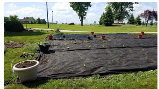
Planting the community garden.