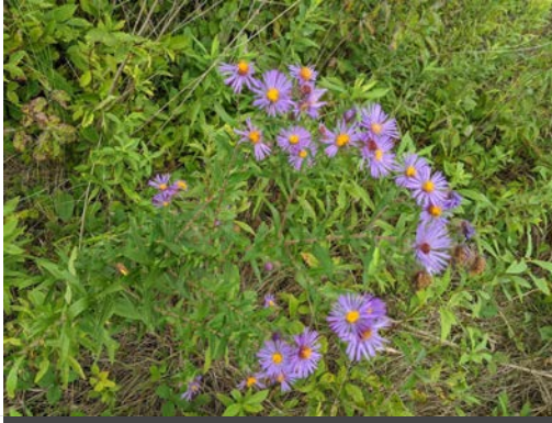
We put some asters in last year.