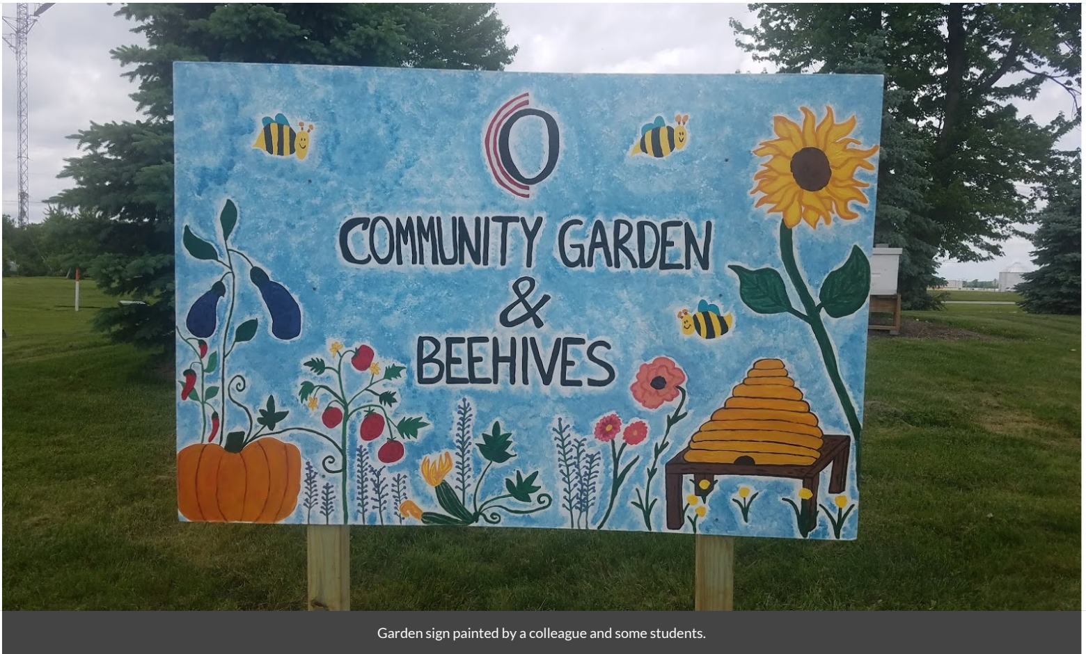
Garden sign painted by a colleague and some students.