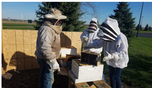
Putting in new boxes of bees.