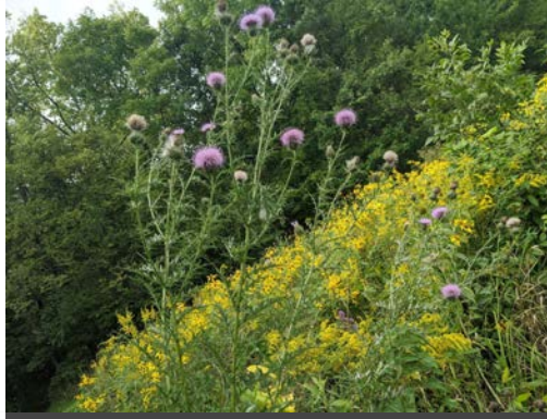
Also a patch of wildflowers.