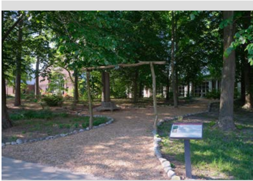
Native plant garden and trail

The Salisbury University Green Fund, a unique program designed to improve environmental sustainability at SU by giving students a say in how their sustainability fees are spent, funded a native species garden and walking path in the Spring of 2015. In the Spring of 2020, the Green Fund supported enhancements and revitalization of this garden area. The Green Fund also supported the purchase of native sedum plugs to enhance an existing living green roof on the Academic Commons. Additional 2020 projects included native plantings in an on-campus bioswale, a monarch waystation planting, and the collection and repurposing of fallen leaves as groundcover throughout campus planting areas. Plantings included the following: Perennials: Monarda fistulosa ; Lavender; Salvia ; Nepeta ; Echinacea ; Allium ; Perovskia ; Rudbeckia hirta ; Eryngium yuccifolium ; Verbena ; Eupatorium ; Asclepias tuberosa ; Pycnanthemum tenuifolium ; Lobelia cardinalis ; Baptisia ; Liatris spicata ; Vernonia . Shrubs: Physocarpus . Trees: Crataegus crus-galli ; Cercis canadensis ; Tilia Americana