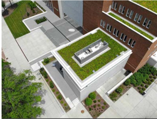
Native sedum planted on a green roof