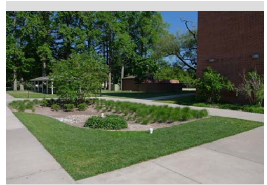
Native plants in bioswale