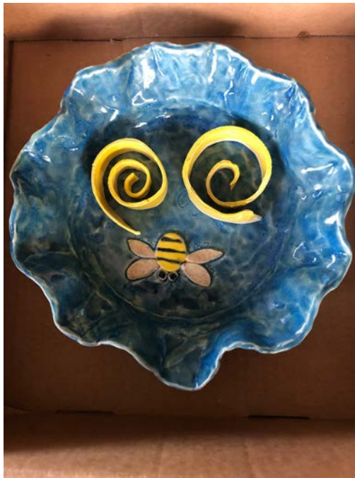
From January 16 through February 27, in conjunction with the Talent Maker City, Talent Garden Club and sponsored by the AARP, we partook in 6 workshops, creating ceramic insect water dishes, mason bee houses, bat boxes, bird houses, etc. for our vital insects, birds and mammals. Gerlinde gave for each workshop a specific presentation. Photo above: one of the finished water dishes.