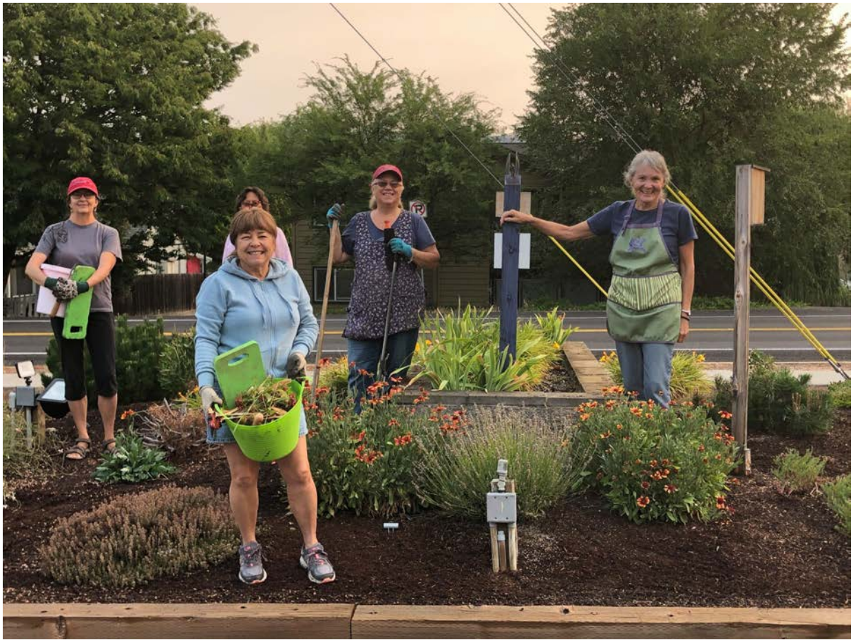
"The Garden Angels" maintain our 8 public pollinator gardens every week.