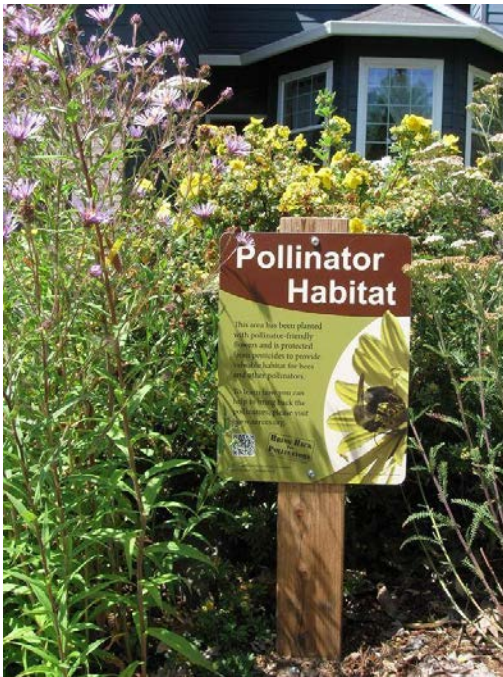
This photo accompanied the above event.