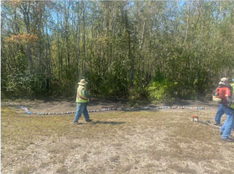
new pollinator garden at cattail marsh

New Landscaping department of City of Beaumont created pollinator gardens all across the city. Bee City Beaumont made two pollinator gardens at Cattail Marsh wetlands education center.