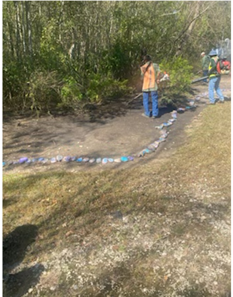
new pollinator garden at cattail marsh