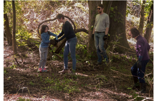
Habitat Improvement at Local Park