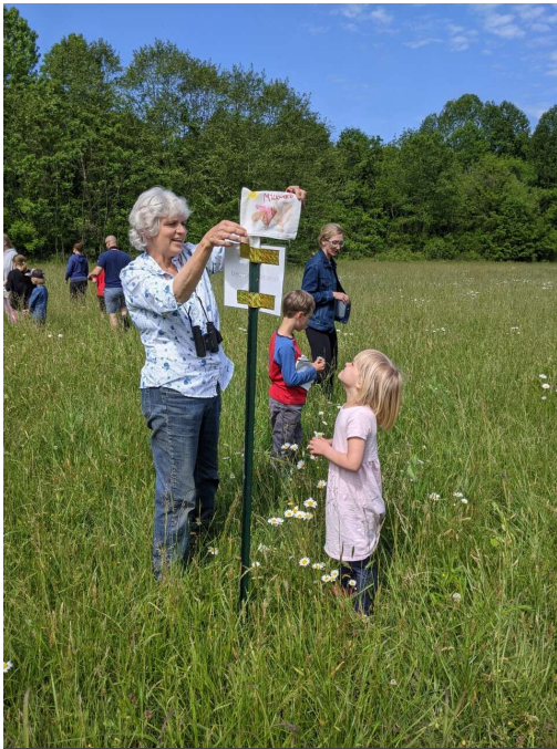
Marking Milkweed Fields

including a Triceratops beetle. A pollinator exhibit from the NC botanical garden, Bee-hold the Humble Pollinator, was presented for two weeks at a local school. Here the children were able to learn about the importance of bees. The exhibit was then moved to the Parks and Recreation Department for observation by local citizens. Lastly, the exhibit was set up at a local retirement community for two days before being returned. We also hosted an outing on birds for adults and one on insects for children.