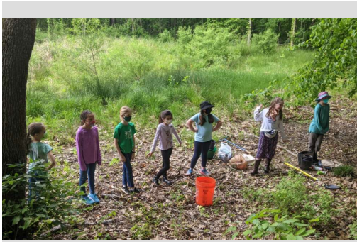
Girl Scout Pollinator Project

A local girl scout troop used their cookie sale profits to purchase pollinator-friendly perennials to plant behind Davidson Elementary, next to a future outdoor classroom space. The girl scouts planted 5 species of milkweed, as well as sedum, bee balm, and perennial sunflower. They then decorated flags to place on stakes so keep the plants from being mowed or trampled. We are certain to have happy pollinators later this summer! Davidson hosted 4 tree plantings, involving 45 volunteers in 2021. A total of 133 trees, including 15 different species, were planted at different locations on town streets and in local parks. Over 20 students and staff from the Community School of Davidson gathered at the Nature Observatory behind Davidson K8 School to improve the nature area, known as the Nature Observatory, behind the school. Students mulched trails, repaired bridges, and cleared an area of brush and invasives for a second outdoor classroom space. On May 1st, a group of 18 volunteers worked hard to clear debris and trash from the woods at Beaty Park to celebrate Around Town Day, a day of service.