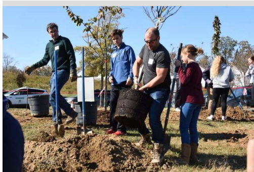
Native Tree Planting