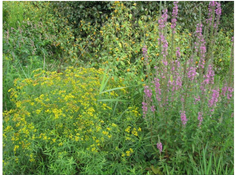
New Hampshire wildflowers that bloom in September are important for honeybees and other native pollinators. The four species growing together include goldenrod, smartweed, jewelweed, and purple loosestrife.