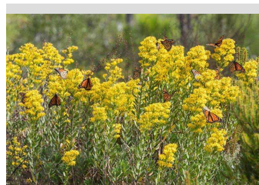
Showy goldenrod wildflowers further decorated with monarch butterflies.