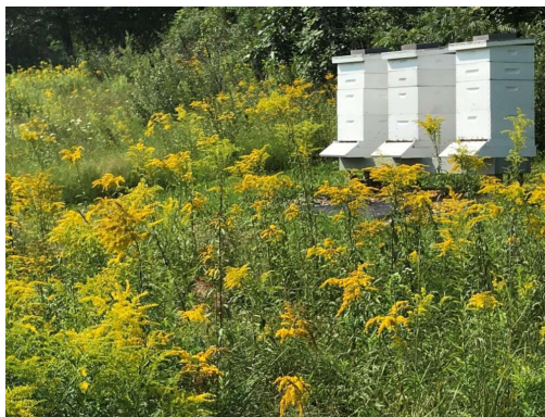
Typically, honeybees in New Hampshire produce more honey from goldenrod than any other species of wildflowers.