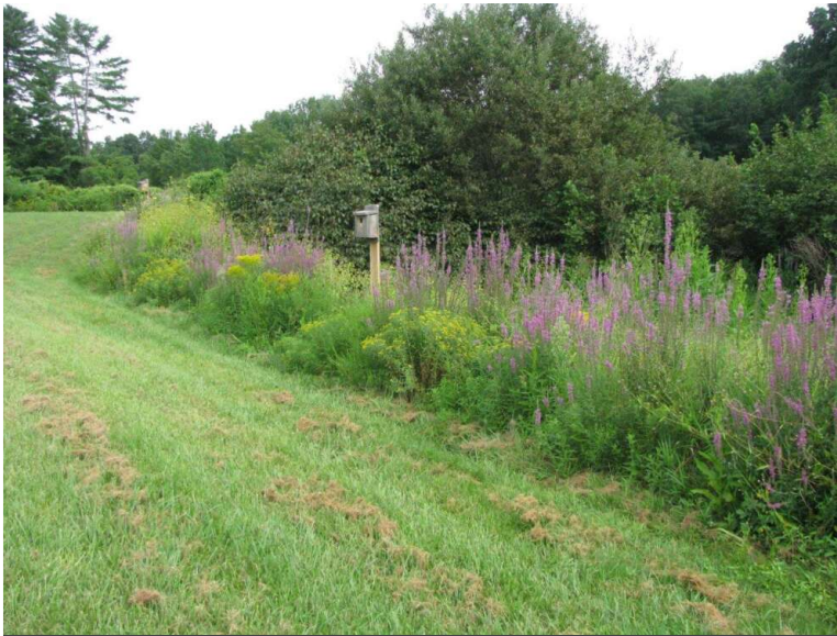
Wildflower habitats important for honeybees and other pollinators can be created/maintained on the edge of agricultural fields.

Dandelions are Bee-utiful Contest – As part of Durham’s Bee Friendly Program, an annual contest is held in April-May to encourage town residents to both recognize the importance of dandelions for honeybees and other pollinators. For 2021 there were 10 contest categories and 25 participants who submitted photos of dandelions happily growing in residential lawns and garden areas.