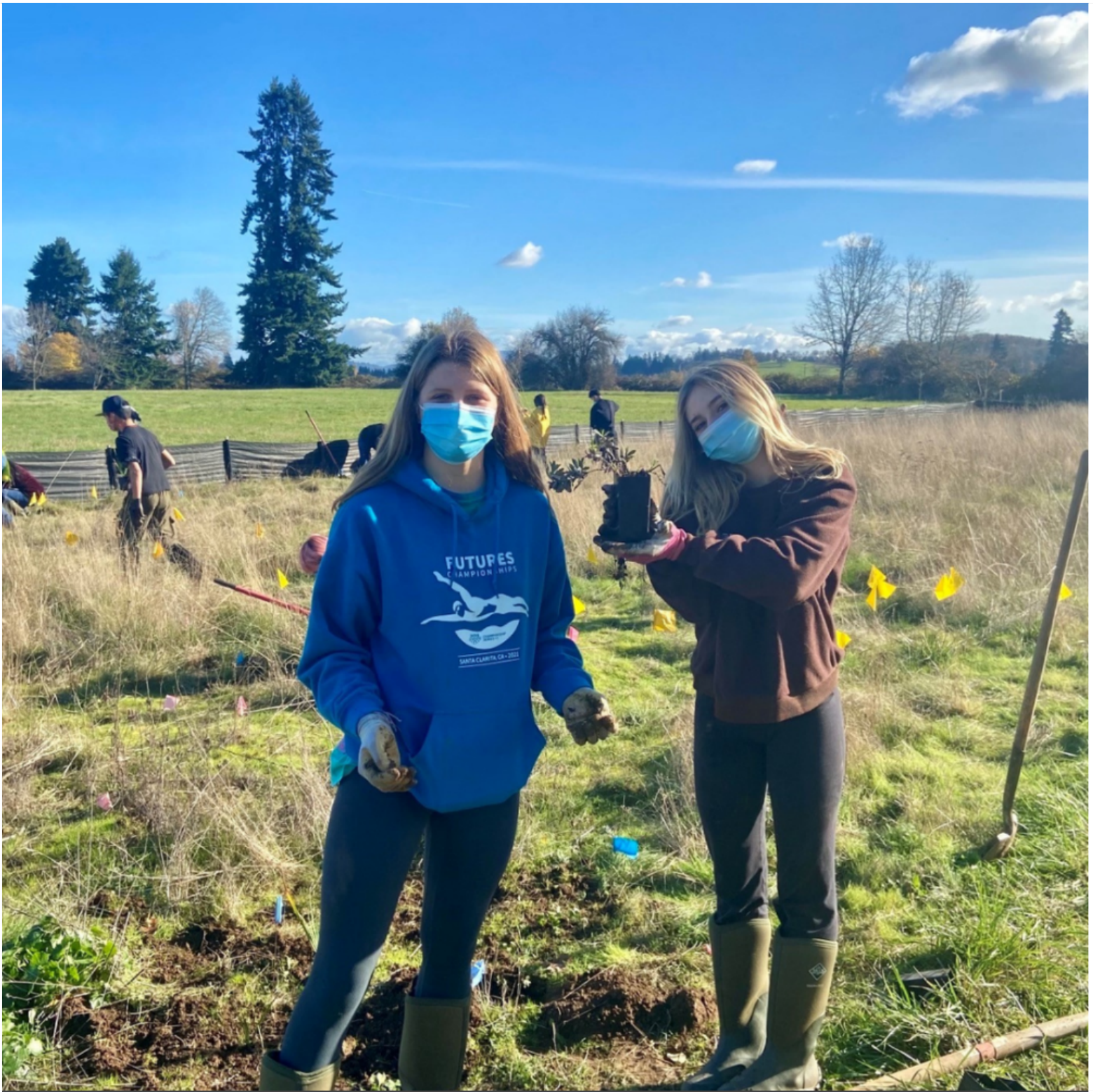
Volunteers planting native flowering plants at a local prairie undergoing restoration efforts.