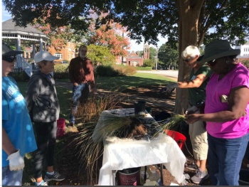
A dividing perennials workshop and planting at our largest pollinator garden

We transformed the City Garden into a Perennial Pollinator Garden. We added more pollinator plants in other areas and taught a perennial division workshop and planted the divisions in the garden. We are switching most of our mulching to leaves that we pick up in our leaf truck to enhance pollinator life cycles