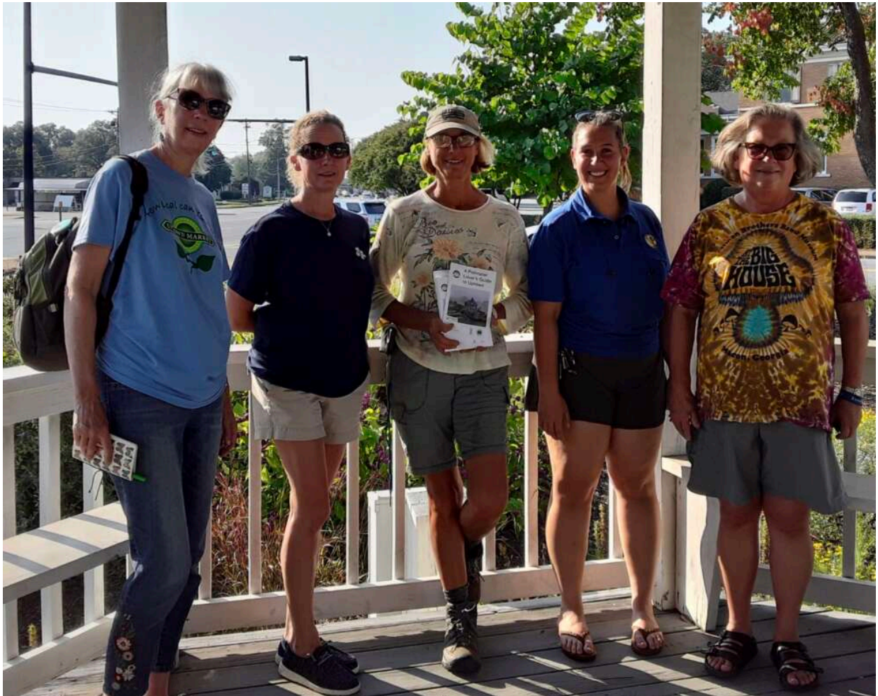
Bee City meeting and displaying our book, The Pollinator Lover's Guide to Uptown