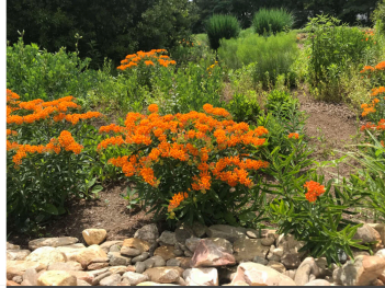
Increased milkweed plantings in the Oak Avenue Pollinator Rain Garden