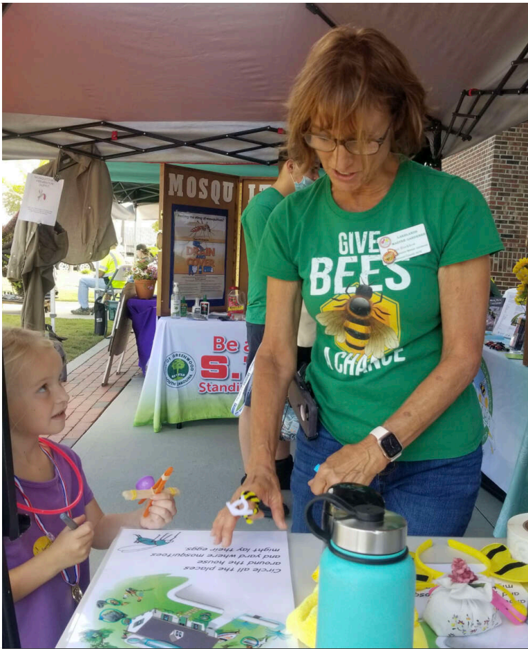
Teaching how to prevent mosquitoes at the STEAM festival for Pesticide reduction