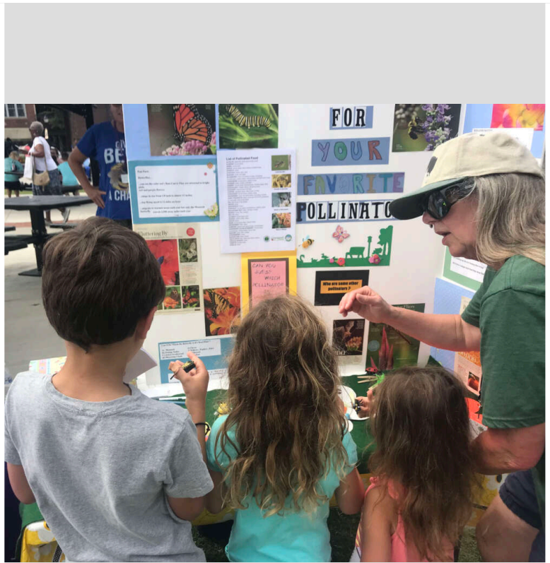
Teaching at Kidfest on Pollinators