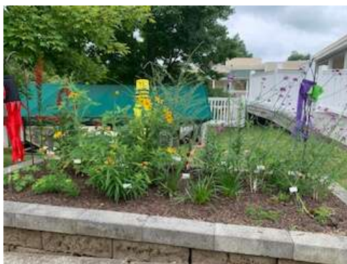
Elizabeth Early Learning Center Color Garden

BRC planted three pollinator beds at the Elizabeth's Early Learning Center focusing on fragrance, color and texture. BRC provided instructional and educational information to staff for an ongoing living and learning project. Teachers will be maintaining the gardens and educating the young students on the importance of protecting and planting for our pollinator friends. Amazement Square installed its pollinator garden as an extension of their "Bee in the Know" exhibition. This exhibition is a live honey bee exhibition and contains six hives: two indoors and four outdoors. The new pollinator garden, designed in partnership with Irvington Spring Farms, features 16 different species of native pollinator plants acting as a year-round food source and habitat for our bees and other pollinators. BRC, in conjunction with the City of Lynchburg, added 200 plants to the Pinkerton Roadside Pollinator Garden Bed. Lynchburg's Parks & Recreation community centers each have a vegetable 'Teaching Garden' on their premises. These gardens were re-furbished and planted with vegetables, herbs and flowers this summer. Enhancements were made to the pollinator gardens at Riverside Park, our local VA Tech Extension Office, the Daniel's Hill Community Center and the City of Lynchburg's Parks & Recreation's main building, Miller Center. These enhancements consisted of native plants, annual pollinator favorites and various herbs and vegetables.