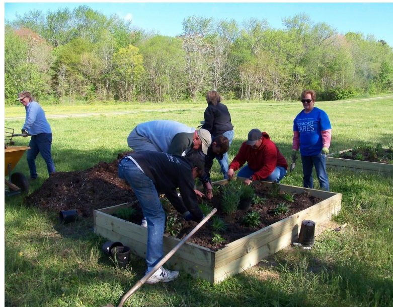
Staff and volunteers creating pollinator gardens in Heron Park.