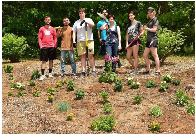
Student Leaders Plant a Monarch Waystation at Blue Ridge Community College