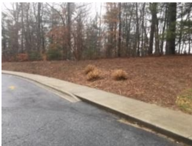
Area selected as a future pollinator habitat.

Through a gracious donation of seed from the NC DNR, Blue Ridge Community College was able to plant four Pollinator Friendly Habitats on campus encompassing over an acre of land. We are excited to see everything we planted come up this Spring!