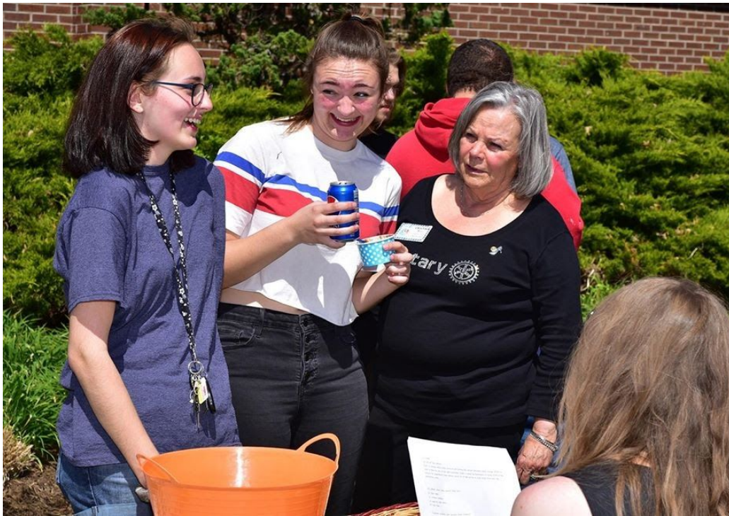
Student Answer Bee Trivia Questions at the Blue Ridge Community College Spring Picnic