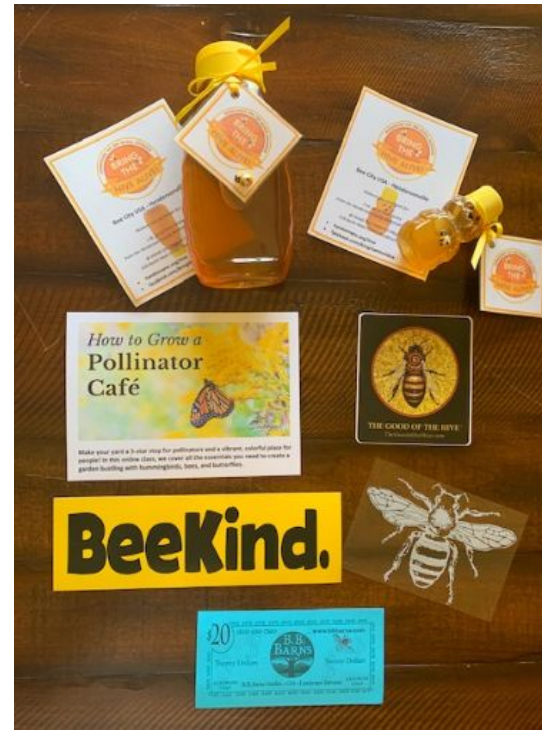
Bee City Hendersonville and Bee Campus Blue Ridge Share a Table at the Annual Harvest Celebration