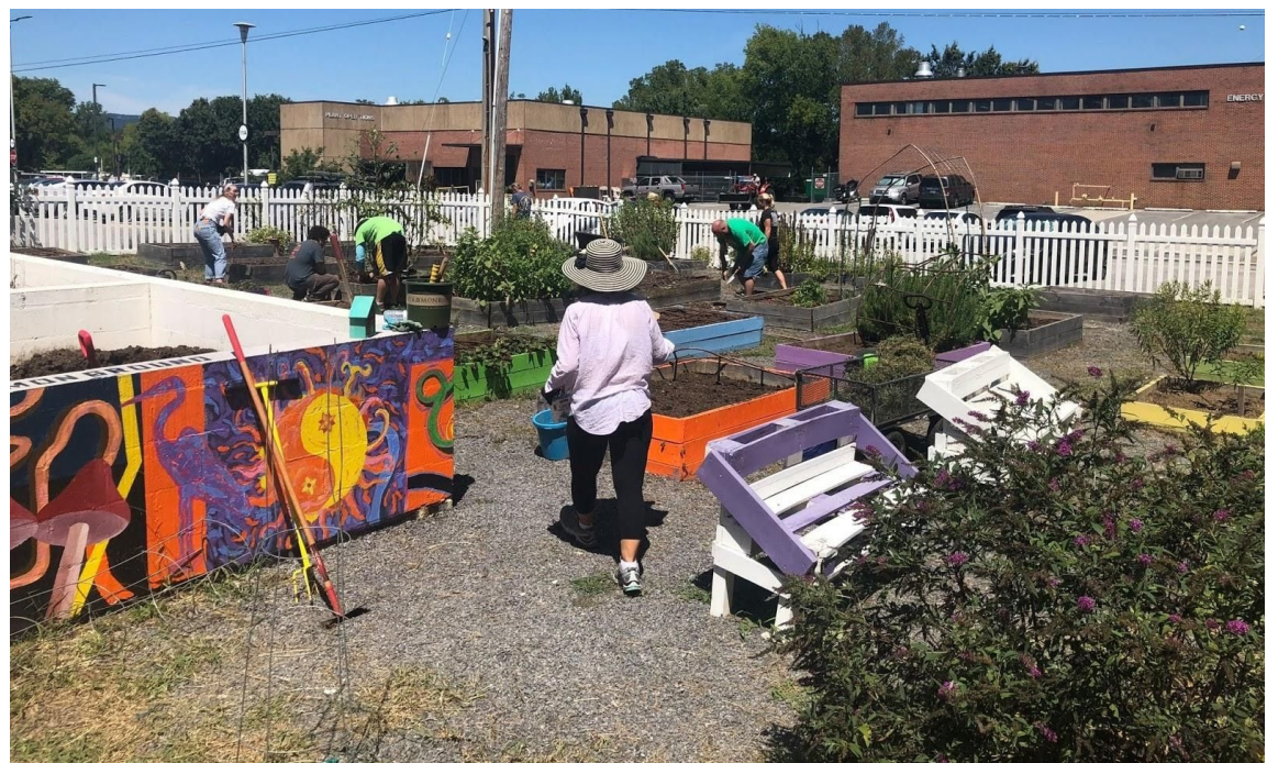
A picture of our native plants in the garden, including milkweed and butterfly bush

Included are 3 beds of milkweed and a butterfly bush.