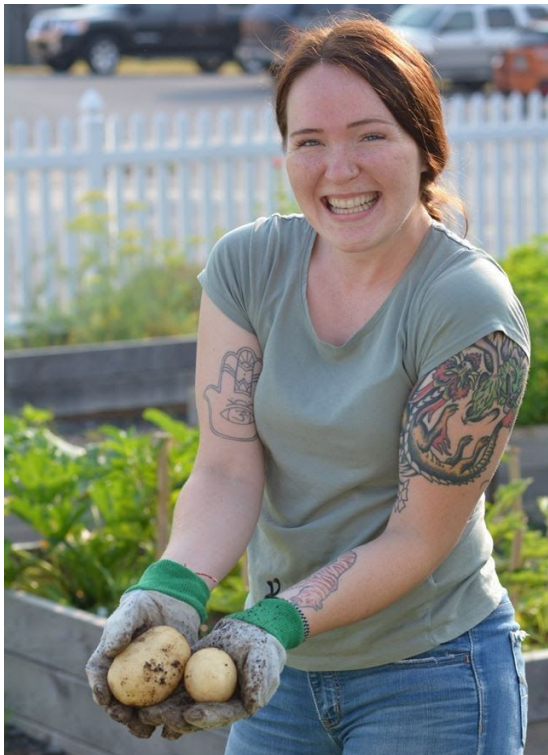
Hopper and potatoes