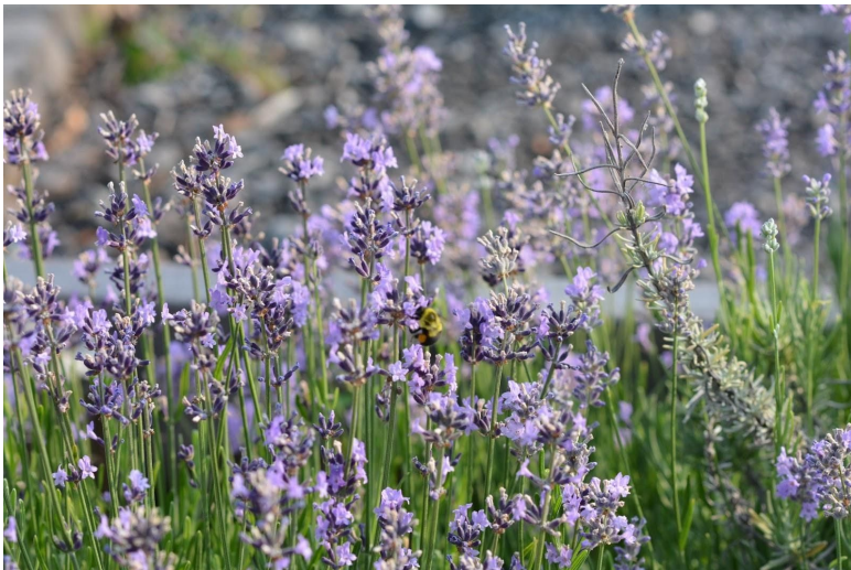
Bee on lavender