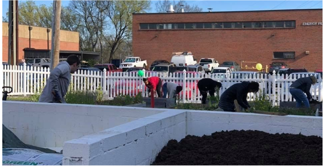
Students working in the garden

Their research project was to research and write on environmental issues, including risks to pollinators.