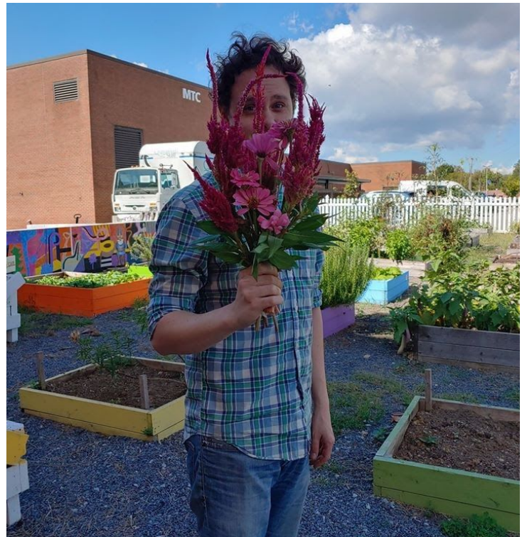
Oren native plants