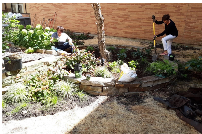
Planting natives in the Japanese Garden