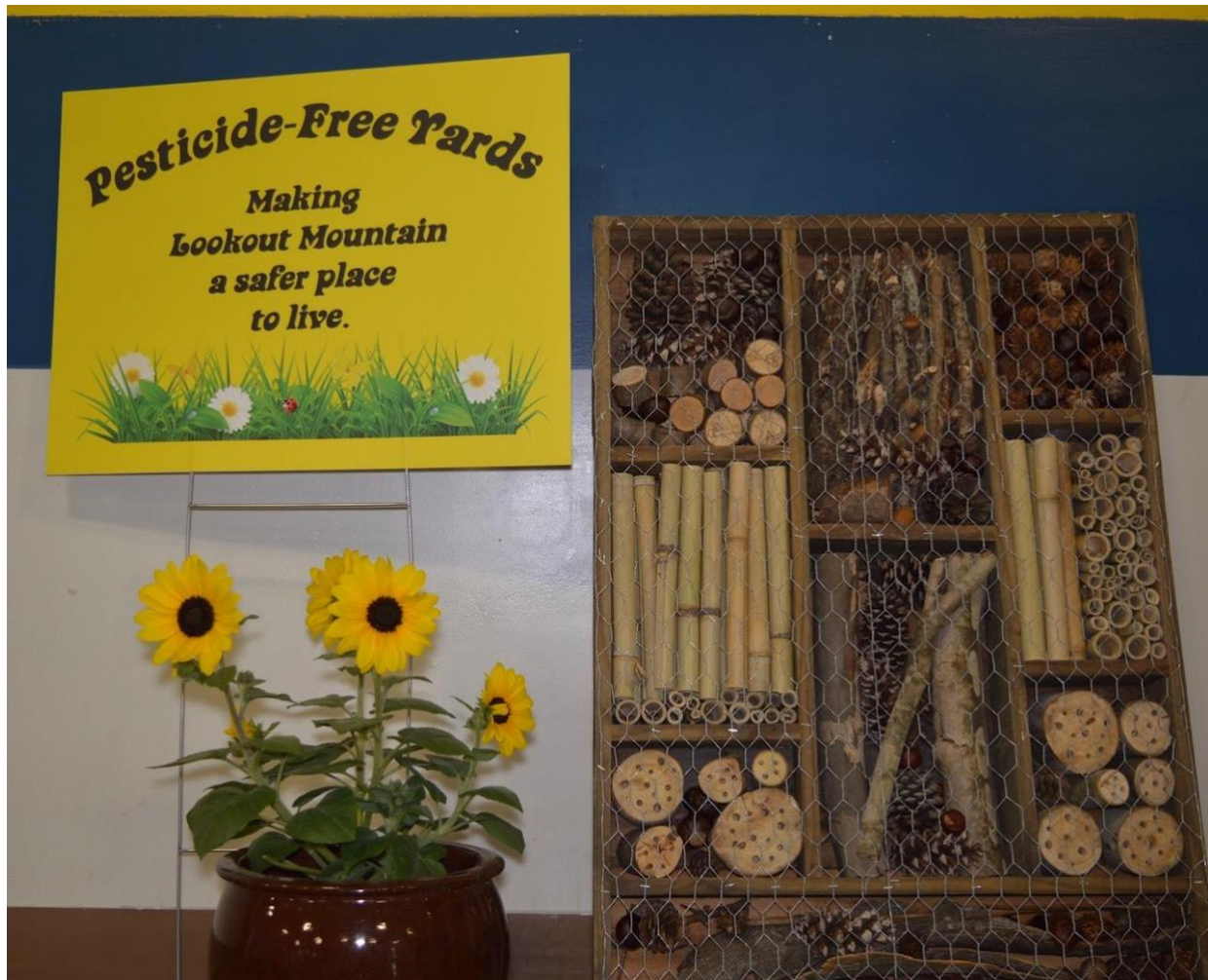
Solitary bee nesting supplies.