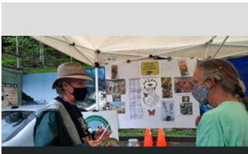
Spring Native Plant Sale

Earth Day Festival, Spring Native Plant Sale, Planting Native Plants in the Greenhouse.