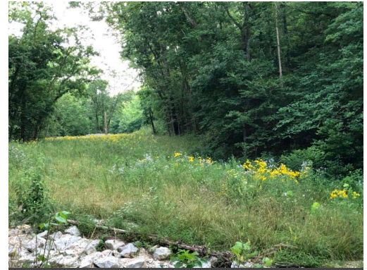
Pollinator prairie restoration project