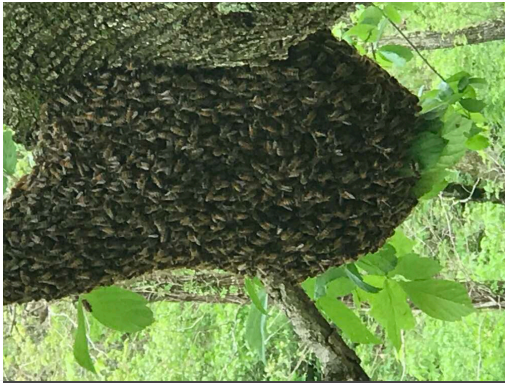
Honey bee swarm

We planted thousands of native plants in our greenhouse and planted many of them in our gardens throughout town. We also had two plant sales with the native plants we grew. We added native plants at the front gate to one of our city parks.