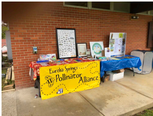
Earth Day 2021 Tabled Educational Event