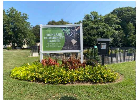
Keep Gastonia Beautiful did a complete overhaul of the Highland Community Garden. Updating all the beds to raised beds for citizens to plant in. The bed around the sign and a selection of the beds are designated for pollinator friendly plantings and are tended to by all gardeners.