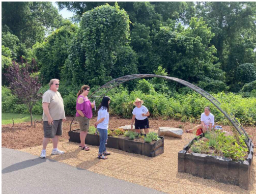
Educational beds installed at our Farmers Market. These beds include herbs and also berries, lettuce and other edible items for hands on learning opportunities.

Our Keep Gastonia Beautiful Bee City USA Committee worked on three pollinator creations and enhancements. First, we installed educational raised beds at our Farmers Market that have items kids of all ages can touch, smell, taste (with parent's permission) to provide an interactive area. Next, we updated the front entrance to our Farmers Market to include only pollinator-friendly plantings. This helps us tie in the fact that the Farmers Market would not be operating if it weren't for bees pollinating crops. Our biggest project was the complete overhaul of a community garden. Raised beds were installed to allow the gardeners more ease when planting. Pollinator-friendly plants are planted around the sign and also in designated beds throughout the garden. We are excited to have this garden as it has provided us with a multitude of volunteer groups who were eager and willing to help us make the transformation happen. This garden is located in a food desert in the city and has provided educational spaces for small meetings to occur to talk about gardening and expanding the urban garden footprint.