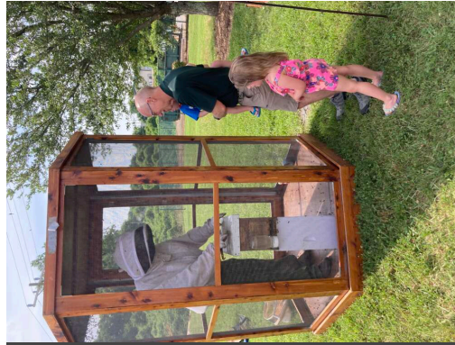
The Gaston County Beekeepers Associations "beezeebo" is always a hit at our Beetopia. It allows people to get up close and personal to our pollinator friends.