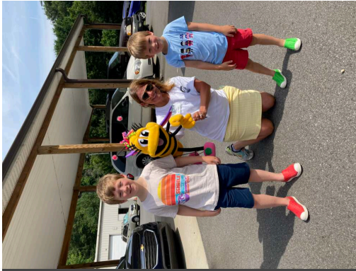
Miss Polly Nator buzzed around our Beetopia event.

hosted a bug day which the Beekeepers Association presented at. We had various partnerships with the Beekeepers to present educational information at the Gaston County Library, various schools, daycares, and afterschool groups. Outreach was also provided by the Beekeepers, in the form of a workshop to a local community garden group.