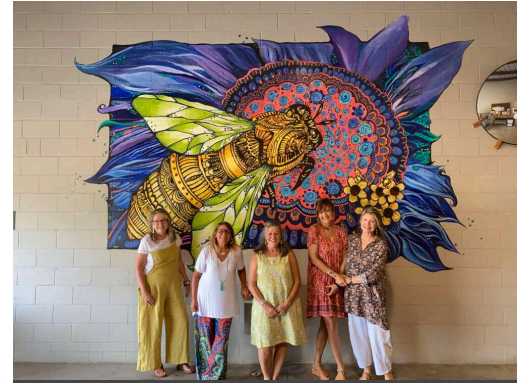
A beautiful bee inspired mural was painted at our Farmers Market to draw highlight to our Bee City USA affiliation. Pictured are the artists who volunteer over 270 hours to create this beautiful pop of color.