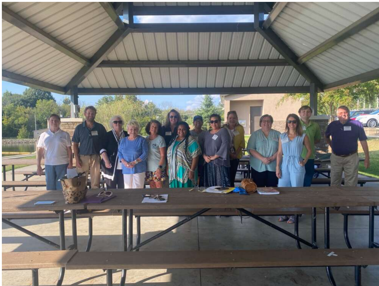
Keep Gastonia Beautiful Bee City Committee plus other board members at our September meeting.

https://www.facebook.com/keepgastoniabeautiful https://www.instagram.com/kgb_nc/