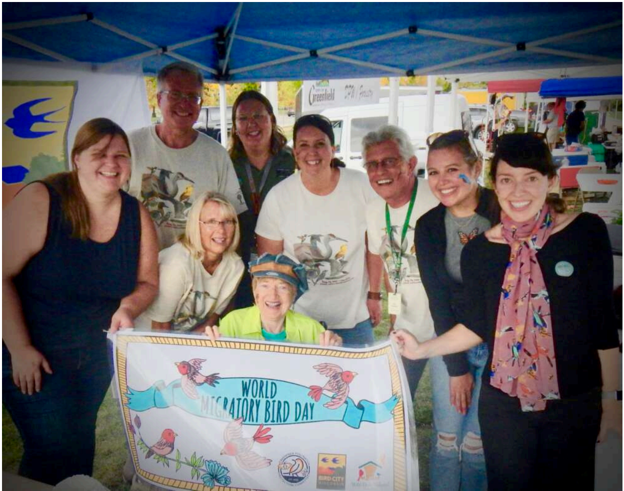
Greenfield Pollinator Protection Committee at our World Migratory Bird Day event.