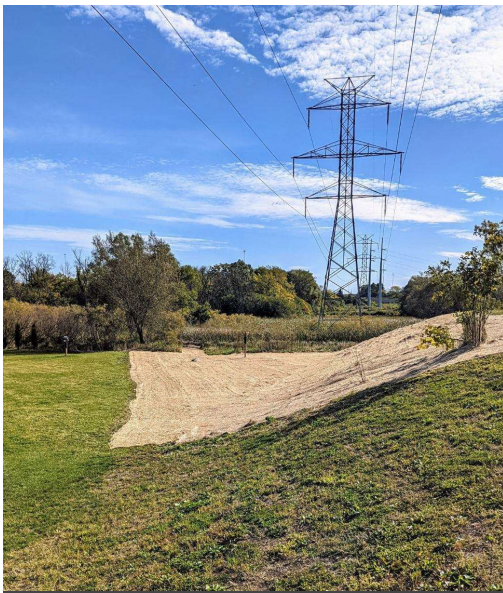
Habitat after seeding.

In 2021, the City of Greenfield planted its first pollinator habitat on public lands at the south end of Kulwicki Park. The habitat is adjacent to a utility corridor, where invasive species were removed, and then seeded with low-growing, native perennial plants, milkweed and flowers (mesic mix). The habitat compliments the new pedestrian path and recently restored wetland area. It also hosts the community's first eBird Hotspot ( https://ebird.org/hotspot/L12319842 ) and a bird feeding station, sponsored by Wild Birds Unlimited. A future goal involves the installation of interpretive signage in this area, to provide information on the importance of pollinators and how residents can help pollinators in their own yards.