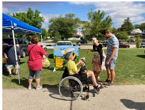
Pollinator events provided fun for young and old!