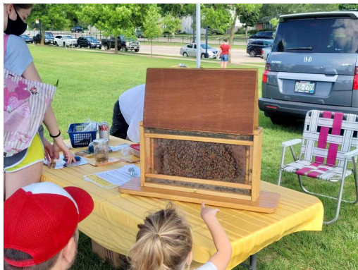
Event attendees study observation bee hive

bird-friendly products, a Q&A session with a bird specialist from the Milwaukee County Zoo, face painting, art, music and more.