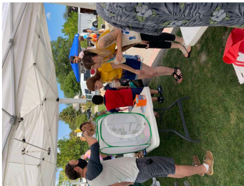
Event attendees admire monarchs