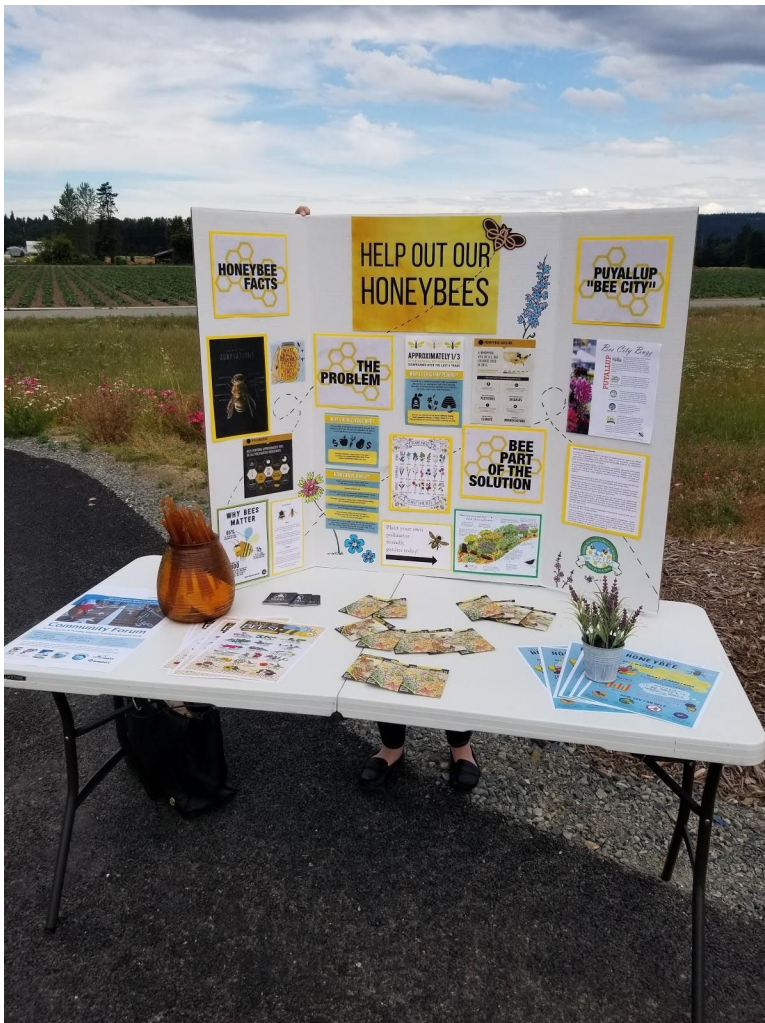
Educational table at Van Lierop Park