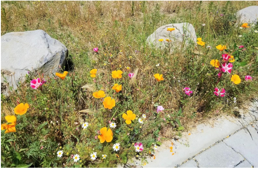
Van Lierop Park meadow plantings

New plantings were created along the Meridian & 7th Street intersection right-of-way. The City's Parks and Recreation team continued to maintain our current pollinator plantings around the city and to remove invasive species.