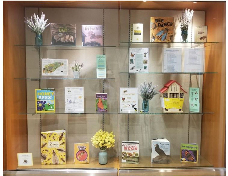
Bee City educational display at Puyallup Public Library.

In October, the City added a rain garden/pollinator garden to the entrance of the public library. 30 volunteers helped with clearing the site and planting native and pollinator-friendly plants. Future plans include interactive pollinator displays and educational programs for children. In October- August, the committee held a display at the library, to include various types of books on pollinators; lists of endangered species and ways to help; gardening tips; planting suggestions, pest management resources; and bee removal resources. Over 50 people were engaged in interacting with the display and checking out pollinator books. New books were ordered based on community demand.