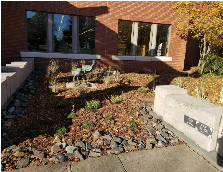
Completed rain/pollinator garden at Puyallup Public Library.

to accommodate them). Also available were gardening tip handouts, planting suggestions; wildflower honey sticks provided by local Bee King's Raw Honey, and free wildflower seed packets for attendees. Booth staff talked with attendees about future plans for the park – to include pollinator habitat areas – and overall goals as a Bee City for 2020. Estimated 50 attendees.