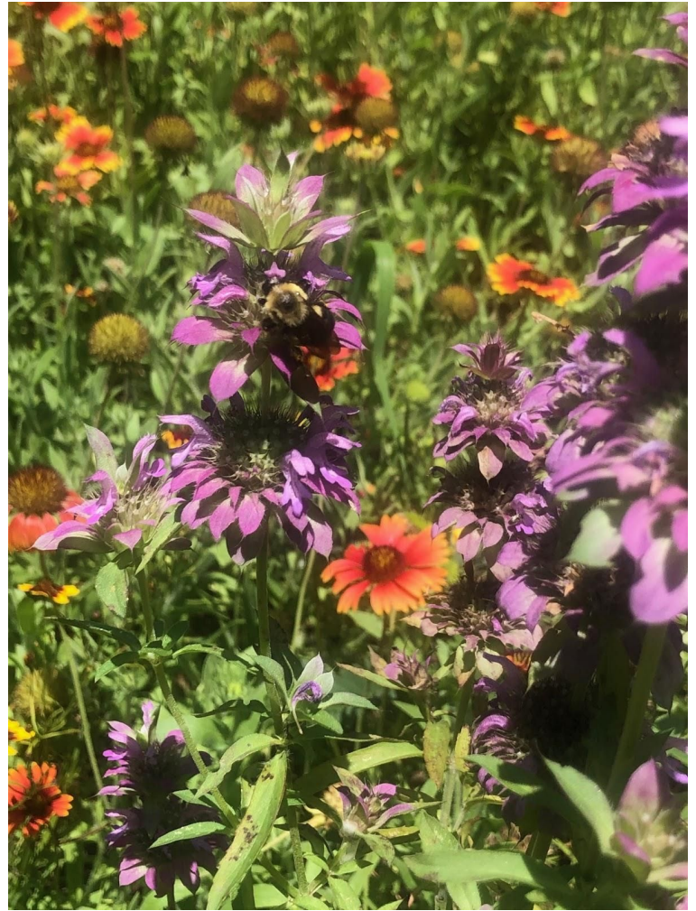
Happy bee at the pollinator plot