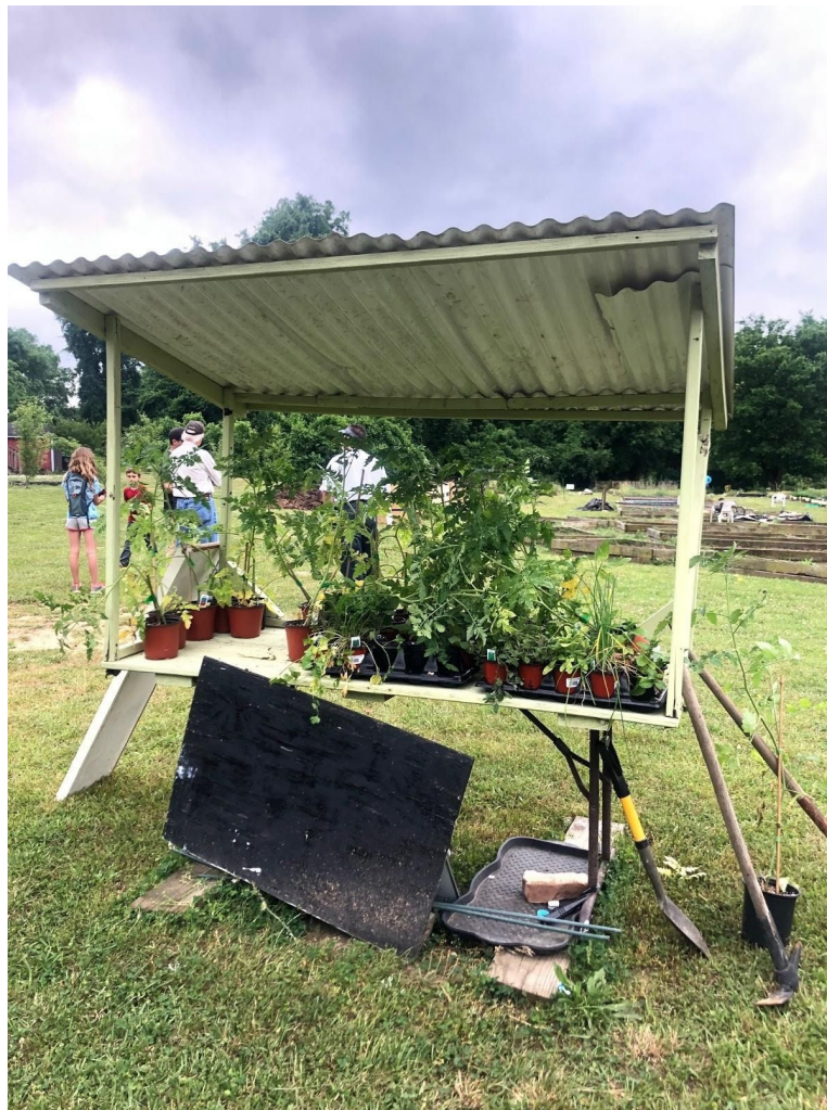
Free veggies at the community garden

For Arbor Day 2019, our Bee Board worked with our Tree Board to select the Willow Oak as the tree species to be planted for our Arbor Day Celebration. Eighteen Willow Oaks were planted on the median of a major entry to Rome. These trees are an important habitat or food source for many insects including aphids, leafhoppers, treehoppers, lace bugs, plant bugs, leaf beetles, weevils, larvae of long-horned beetles, gall wasps, walking sticks, and caterpillars of moths, butterflies, and skippers.