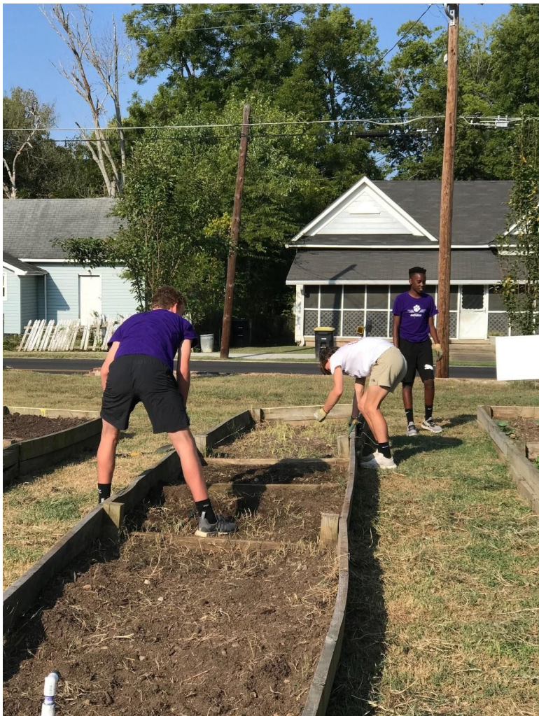
Improving the raised beds