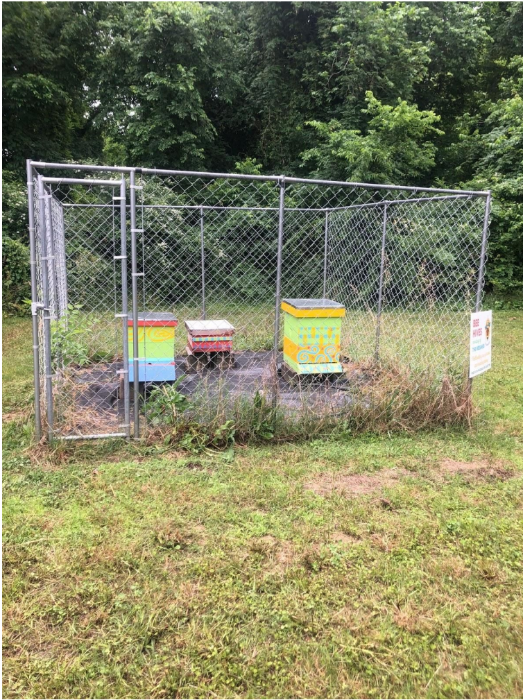
Hive boxes at South Rome Garden