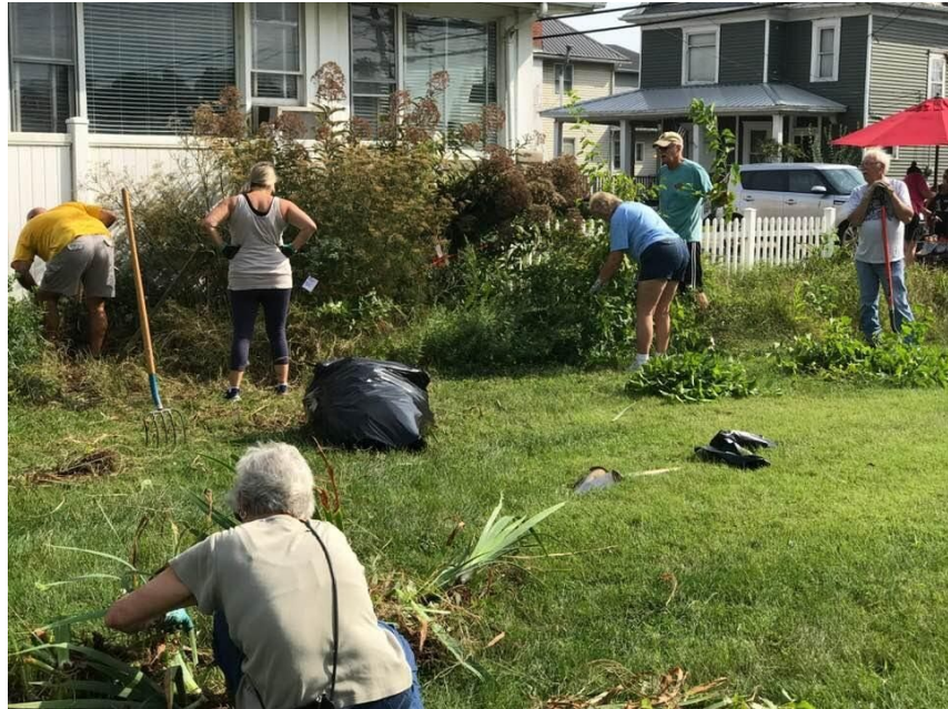
Our committee at work

Social Media — Bee City USA - Williamstown, WV (Facebook Group)