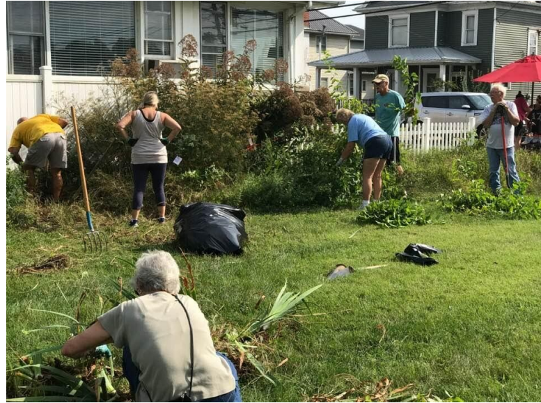
Taking out the old garden