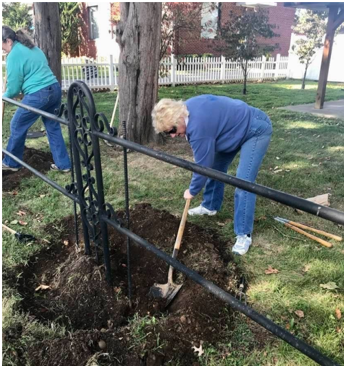
Planting crocus for early spring pollinators