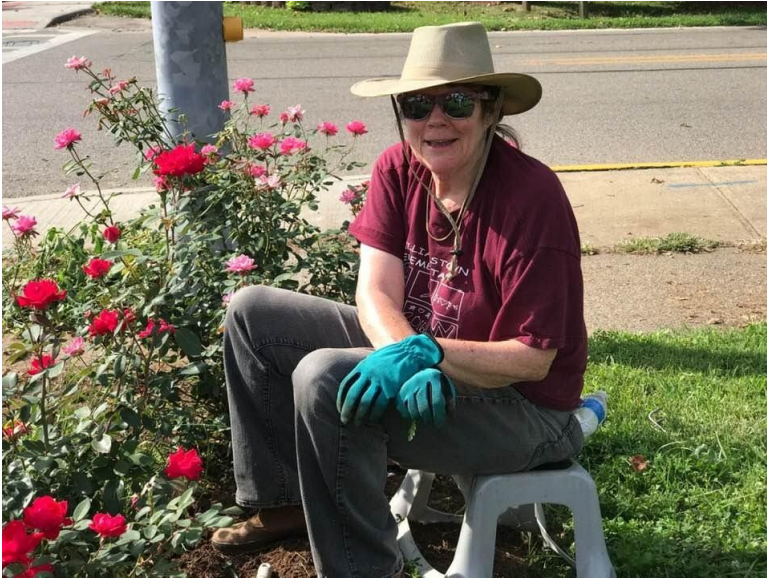
Working on the rose garden

This year we prepared the Armstrong Garden to convert it from a beautification project of the local Master Gardeners to a series of pollinator gardens that can be used by area residents to visualize what plants they can possibly plant in their own gardens at home to attract pollinators.