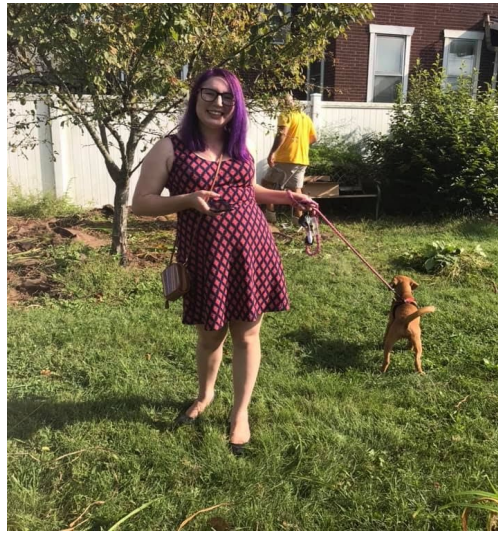
The community turned out to observe