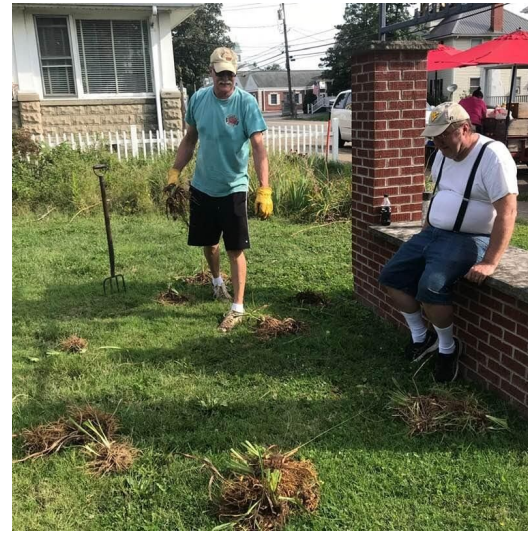
Setting the old plants aside to donate to the community

We converted a Master Gardener garden to a pollinator garden. This was done with the assistance of the Master Gardeners and also residents of the city who showed up to help. We are doing a complete redesign of the area to feature a landscape type garden featuring pollinator plants as well as a meadow type garden for pollinators. This is a highly visible area and our hope is that residents will be able to come to the garden and identify plants and garden types that they can use on their own property.