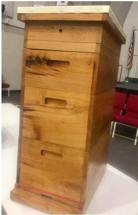
Hive used as prop for speaker