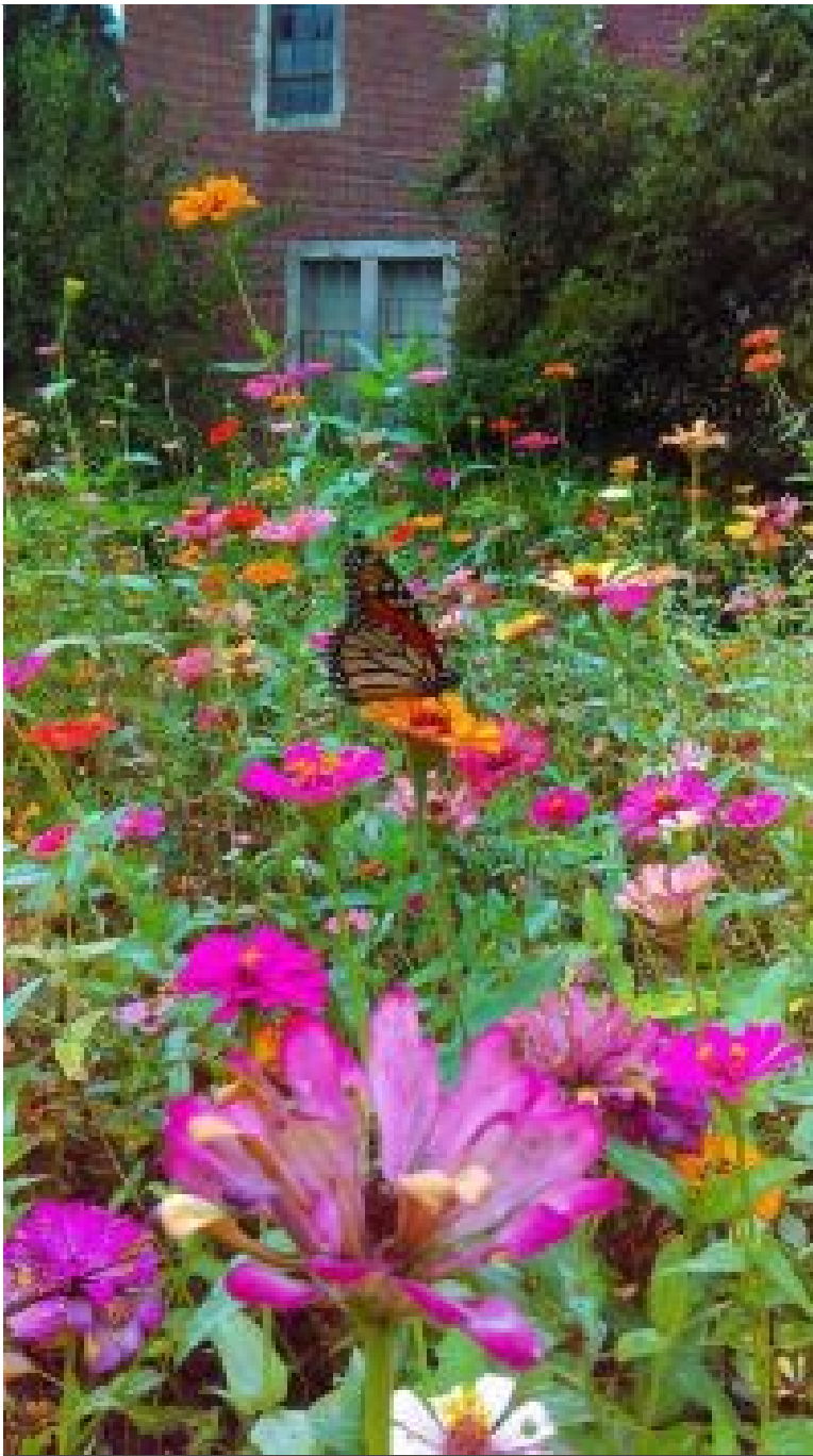
Pollinator in the garden during habitat enhancement workday.