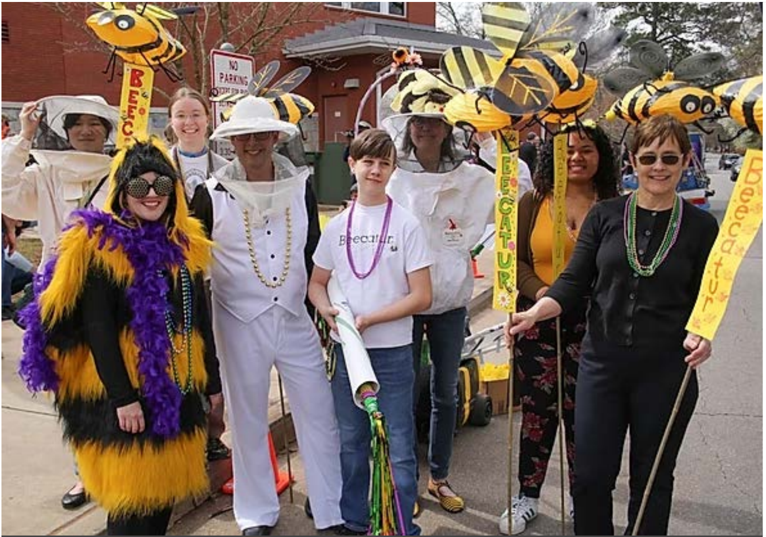
Agnes Scott students at the annual Beecatur annual Mead Road Mardi Gras.