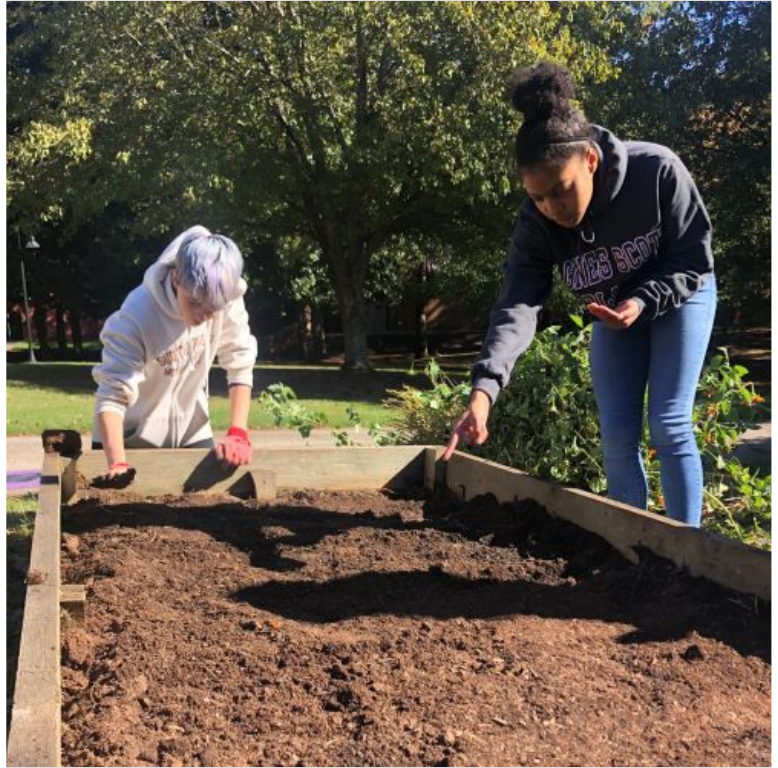
Students working in the garden