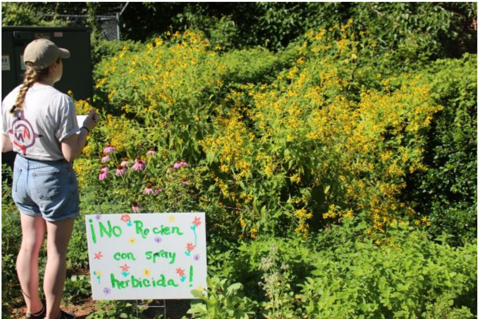
Student counting pollinators next to "Do Not Spray Herbicide" Sign in Spanish