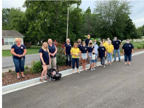
Tour of “Granny Wilson’s”, a new pollinator garden established in Carlinville. The garden borders a busy street and a shopping center. It includes 130 native trees, shrubs and pollinators. Shown are members of the community, showing support for pollinator habitat wearing clothing purchased as a fund raiser. Bee City USA, Carlinville leadership and the honorable Mayor Deanna Demuzio, hosted the October 7, 2020 event.