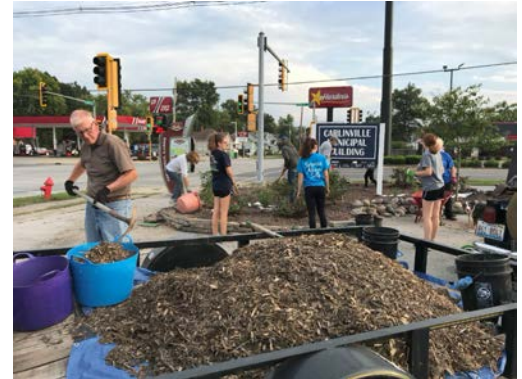
Members of the youth organization “Interact”, a Carlinville High School Co-curricular group (sponsored by the local Rotary Club) assisted “Make Carlinville Beautiful” volunteers. This overgrown landscape area at the Carlinville City Hall was re-landscaped with native plants that support pollinator habitat. The finished garden will support another Bee City “street sign”. Bee City signs are present at each City Welcome Sign garden and are placed among the 19 large planters on the City Square. Each planter was filled with a variety of pollinator plants including; milkweed, coneflowers, mountain mint, spiderwort and others.