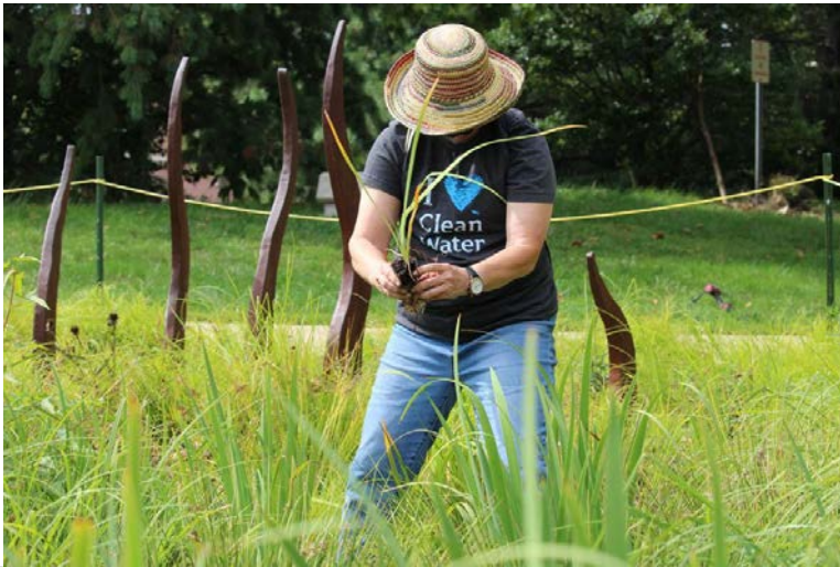
A volunteer at the Red Oak Rain Garden getting ready to plant another native specimen.

Red Bison (a UIUC registered student organization (RSO)) hosts weekly volunteer days for weeding and cutting back invasive species on campus woodland and prairie spaces. The total area of the woodland and prairie where they work to remove invasives is approximately 21.5 acres. The Red Oak Rain Garden, a 9,000 square foot native plant rain garden, has been continually enhanced this past year through volunteer working days and the addition of more plants and plant species. From The Ground Up (the partner RSO to UIUC Bee Campus) received grant funding in Spring 2020 for two habitat restoration projects on campus. This includes the Orchard Down's Plot Restoration project, in which the club is restoring a 3.7-acre local plot of land to a native, low-grass prairie. The other project is the Foreign Language Building Garden Renovation, where the club is revamping the current "rock garden" outside the building to house a variety of native, pollinator-friendly plants in order to establish a new pollinator habitat on campus and increase education surrounding pollinators and native Illinois plants.