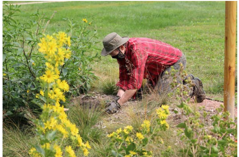
Another volunteer at the Red Oak Rain Garden helping to plant more natives.