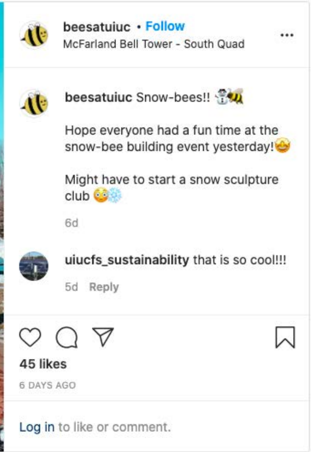
The UIUC BeeKeeping Club hosted an impromptu snow bee sculpting activity during the Winter of 2021! Here's a screenshot from their instagram.