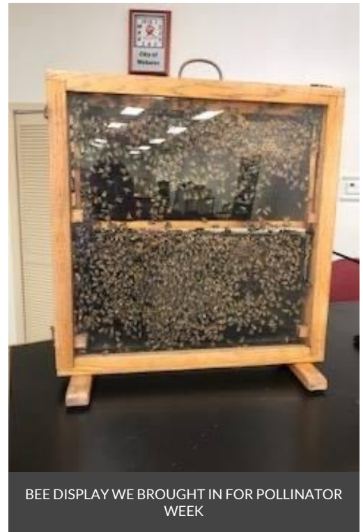
BEE DISPLAY WE BROUGHT IN FOR POLLINATOR WEEK