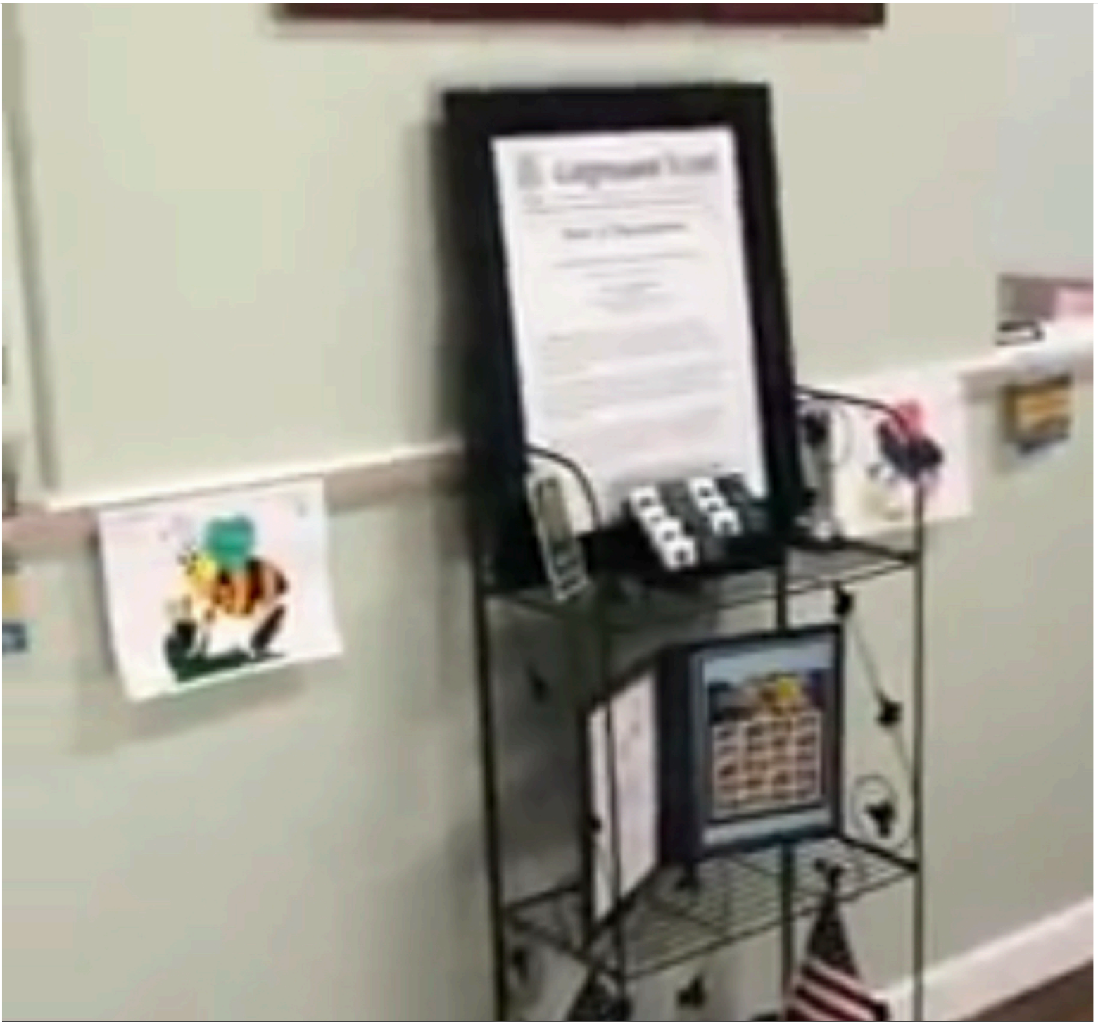
We did Host a coloring contest to educate the children in our community.