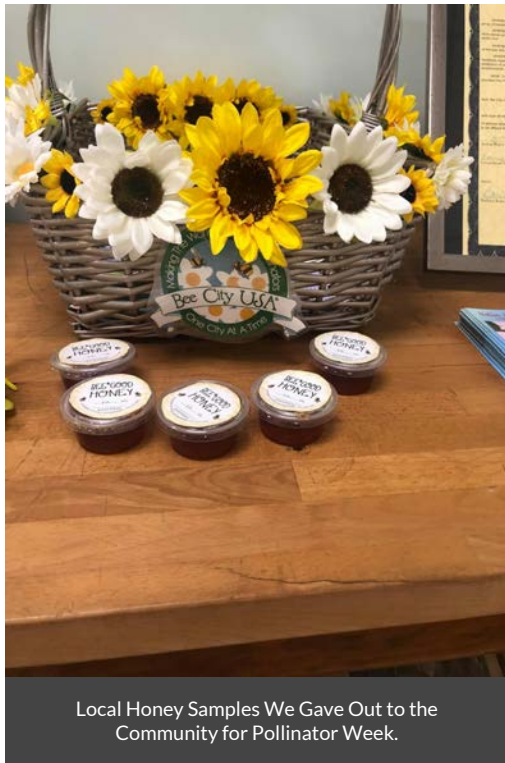
Local Honey Samples We Gave Out to the Community for Pollinator Week.

We had two small events due to the Pandemic. The first event we had was a coloring contest. We had a 4-7 age entry level, and 8-12 age entry level that could participate. We had the contestants color A Save The Bees sheet for Pollinator week. We had two winners and we gave each winner a honey bear container full of fresh local honey. Also, for Pollinator week we gave out local Honey Samples and pamphlets on how to plant and grow a pollinator friendly Garden. We could not do the events that we usually do because of the terrible pandemic that hit our country. Due to the pandemic, we tried to do small events that were Covid-19 Safe for our community. We always keep several brochures on Pollinator friendly plants, how to protect our Pollinators and we even have materials on safe Herbicides to use in pollinator garden. We have created a beautiful display in City Hall that houses all our Pollinator education material and our Bee City Proclamation. We have a lot of citizens who are very interested in our display and always ask questions about how they can protect our pollinators and how to plant a pollinator friendly garden.