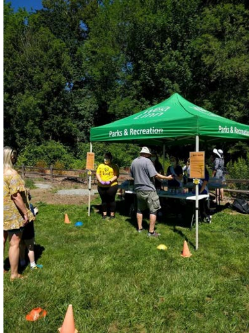
Pollinator Week Booth, different activities each day