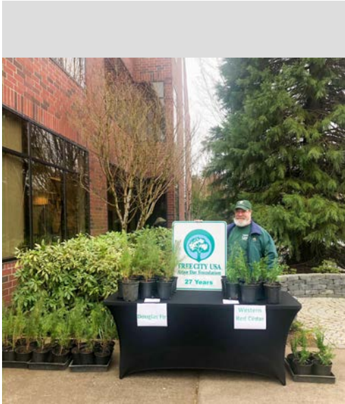
Arbor Week Native Plant Giveaway

Arbor week native plant giveaways to citizens. Pollinator Week activities including plant giveaways, mason bee house craft, activities. Community Service project installing puddling stations in the pollinator garden. Volunteers planting native trees and shrubs and eradicating weeds in the parks.