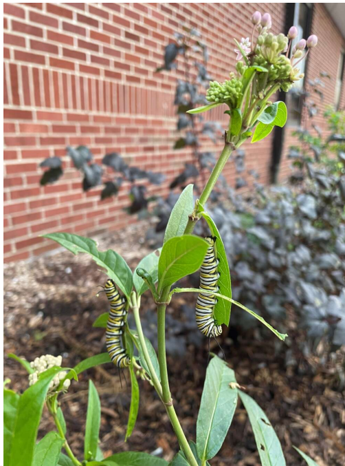
Monarch caterpillars dining in the "Administrators Garden" at Carlinville High School near the Carlinville High School