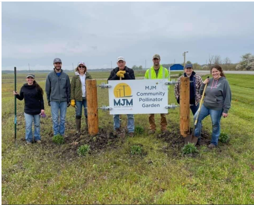
Ground breaking of the MJM Community Pollinator Garden, April 17, 2022.