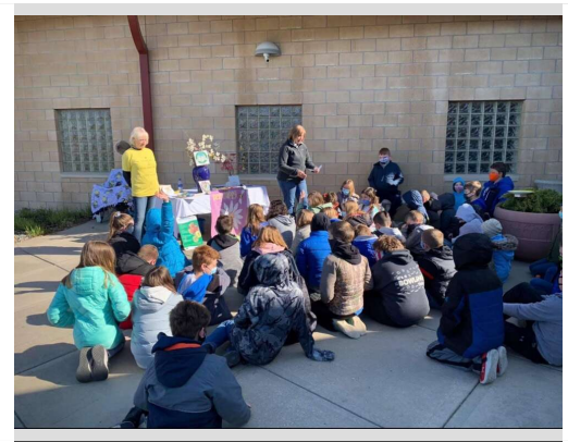
Carlinville Elementary students learn what it takes to be the 1st Bee City in Illinois. We discussed nectar, habitat, pest control and personal responsibility.