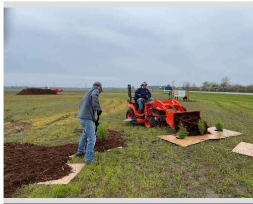
Volunteers using the "lasagna method" of no till planting of native shrubs and plants.