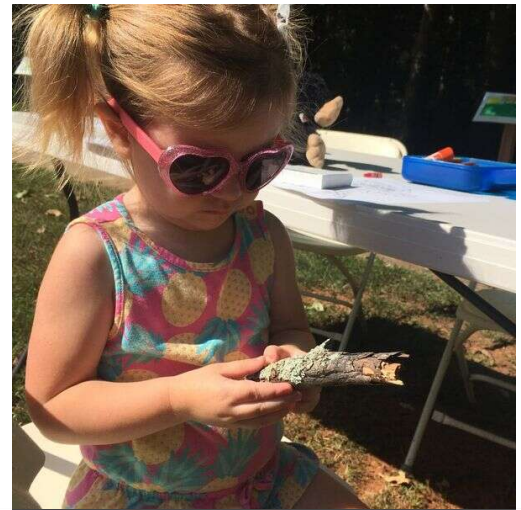
Young participant checks out caterpillar at White Deer Park in Garner