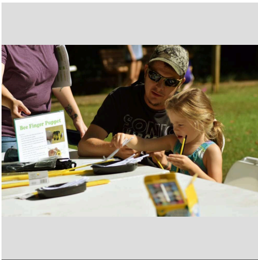
Family enjoys Bee Finger Puppet activity at White Deer Park in Garner