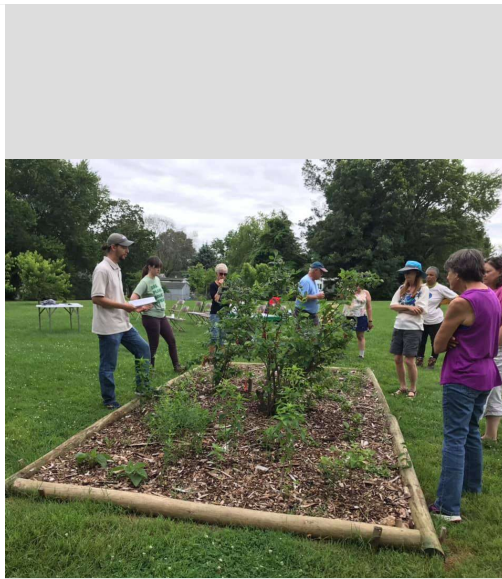
Green Team volunteers learn how to maintain the new permaculture beds at the Todd Park Food Forest