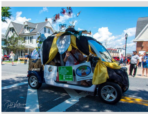
Havre de Grace Green Team Pollinator Float at the 2021 Fourth of July parade