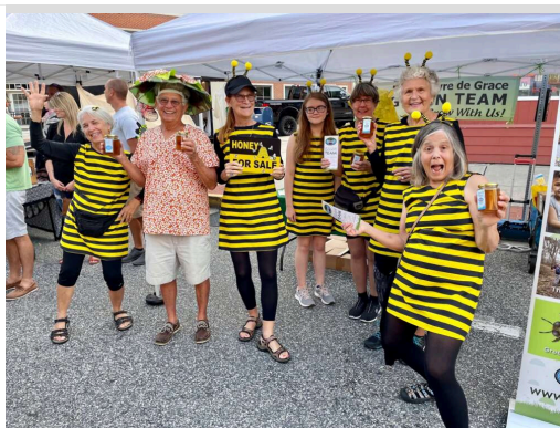
Havre de Grace Green Teamers reuse our parade costumes at First Friday event

importance of pollinators and the Bay-wise program, as well as other garden and food system related themes. • HDG Apiary Hands On Events. The Havre de Grace Green Team Apiary provides volunteers and aspiring beekeepers the opportunity to assist with care and maintenance of honeybees and honey harvesting. As part of our ongoing outreach, volunteers were invited to two events. The first event beyond general hive/bee maintenance was an event where volunteers had the opportunity to help with all stages of the honey harvest in July. In Oct, our project lead held a hands-on demonstration of making candy boards to help the honeybees overwinter in the hives. • HDG Holiday Tree Jubilee. In support of the Independence Day Commission fundraiser, the HdG Green Team donated a Pollinator-themed tree “BEE-Utiful Holiday”. It featured wildflower seed packets and a jar of honey from our apiary, as well as Green Team and Bee City brochures for potential bidders to take with them. We plan to add Bee City USA Logo street signs and request the City to issue a National Pollinator Week proclamation in 2022.