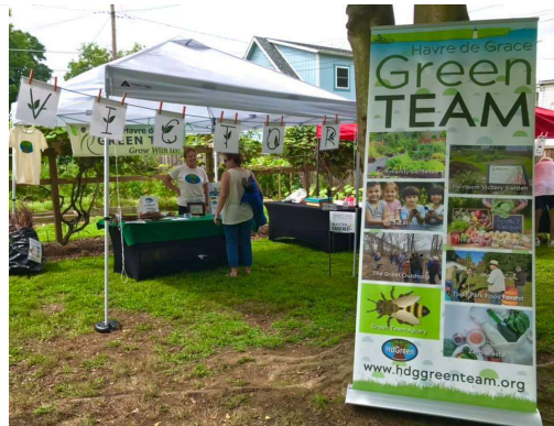
HdG Green Team and U of M Master Gardeners promote pollinators and the Bay Wise program at the Waterfront Festival