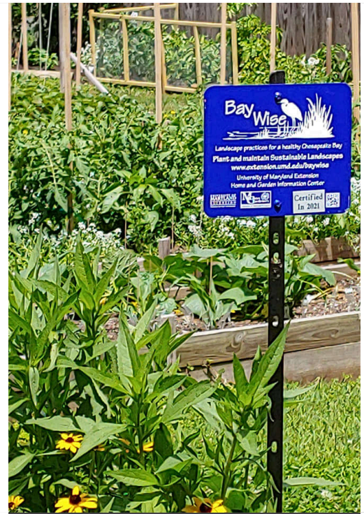
Heirloom Victory Garden achieves Bay wise certification