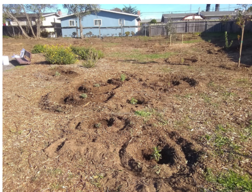
Habitat expansion at Lincoln-Cunningham Park demonstrates planting basins and rain-catching swales.