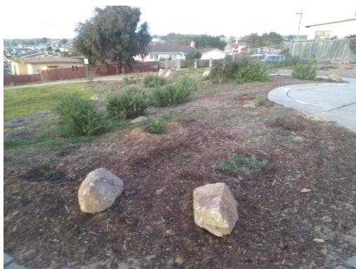
Boulders placed at high-traffic edges of pollinator gardens to protect new plants (Beta Park).

21,000sf of new area was created and 17,700sf were maintained. The work is coordinated by the committee, plus two nonprofit.