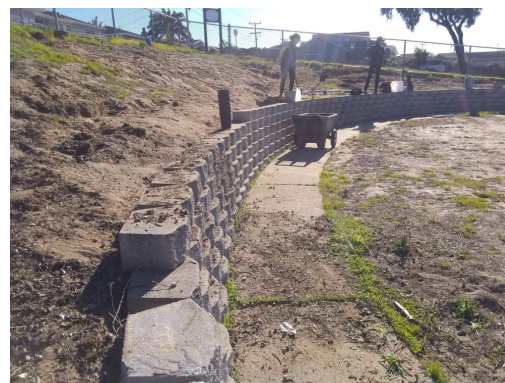
When possible, volunteers gave additional hours to do weed removal and pre-irrigation to prepare sites in advance of volunteer planting days. Location: Capra Park.