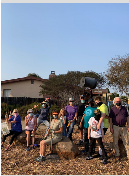
Volunteers of all ages participate in pollinator garden maintenance days at Seaside public parks every Saturday from 10am-12pm, since 4/3/21.