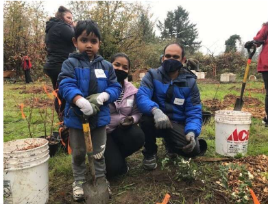
Put Down Roots in Tualatin