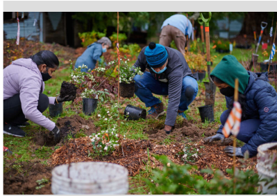
Put Down Roots in Tualatin

16 events were held in Tualatin in 2021 that enhanced pollinator habitat. 9 of those events were planting events where native trees shrubs and flowering herbaceous plants were installed. The remaining 7 events were site preparation for future plantings (invasive species removal) and restoration site follow up care (watering / invasive removal).