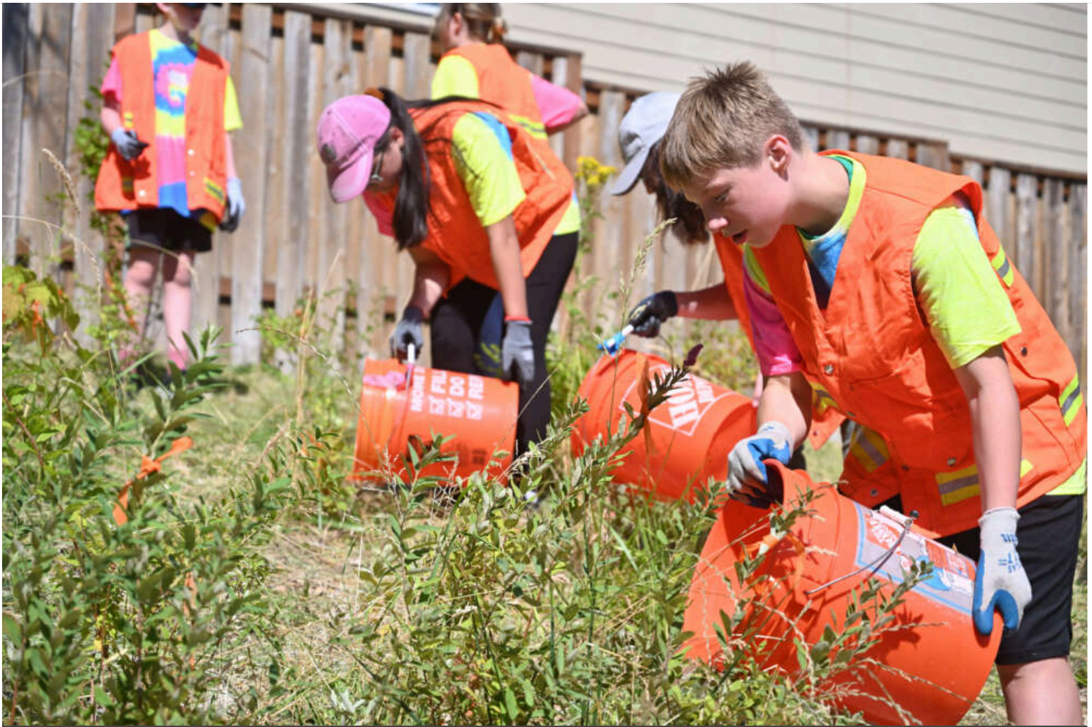
Volunteers watering native plantings.