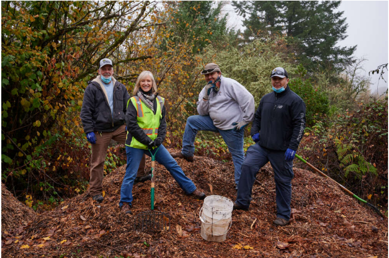
City of Tualaitn Parks Maintenance Staff

https://www.tualatinoregon.gov/recreation/bee-city-usa%C2%AE-city-tualatin