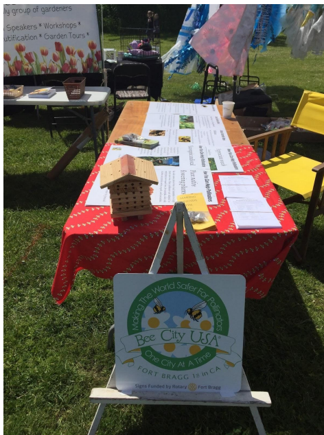
Fort Bragg Bee City Committee Sponsored a booth at the community Earth Day event in April, attended by 2000 people.

The Committee worked with Fort Bragg school and organizational gardens, and with gardens in nearby communities Caspar and Mendocino to increase local bee forage. Committee members gave eight public presentations to civic clubs and community groups. An additional lecture entitled “Bee Gardening at Every Size,” sponsored by FBGC, held at Mendocino Coast Botanical Gardens, drew close to 60 attendees. In April at Noyo Food Forest’s Earth Day Festival, Bee City USA participated in educational exhibits and, with members of Fort Bragg Garden Club, volunteered at a Bee City USA information table. The City celebrated its 130th birthday in October with a Bee City-themed street party, with bee shaped cookies for visitors to City Hall and a Bee City information booth in front of City Hall which was visited by hundreds of locals interested in how to help the bees.