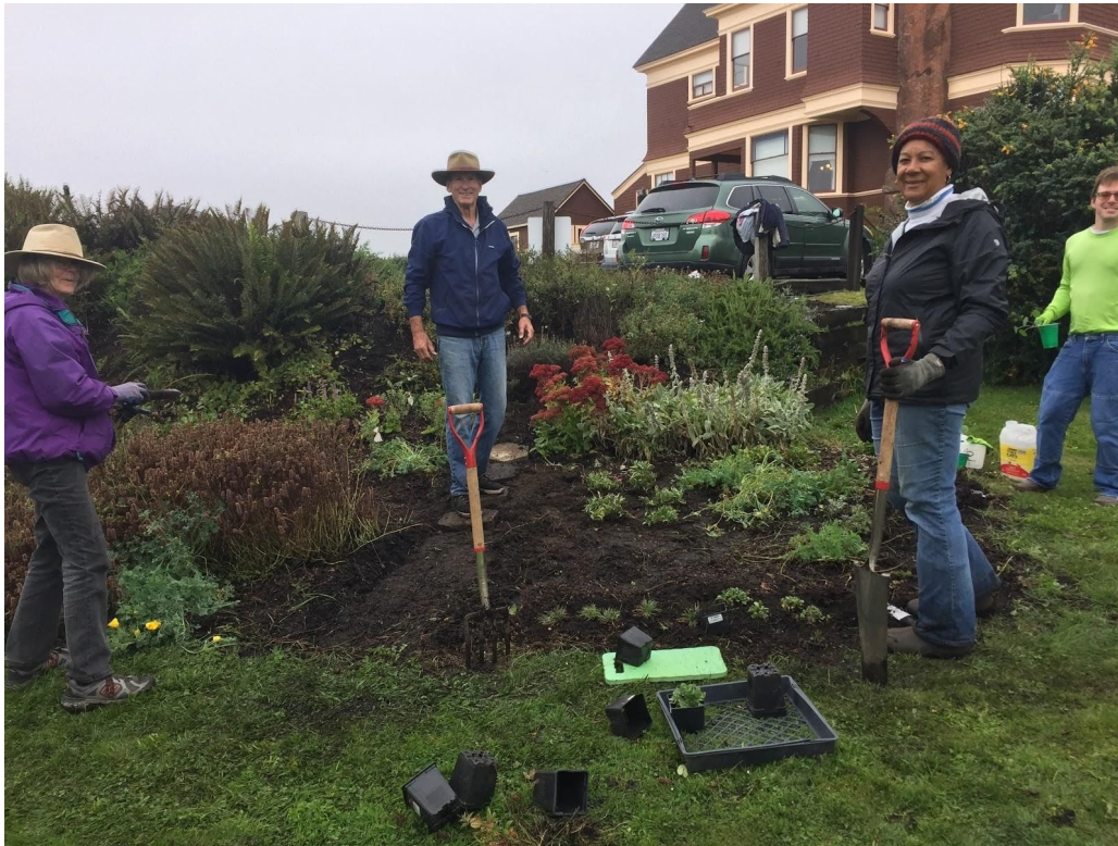
Volunteers working at the Fall Planting at the Guest House Bee City Garden.