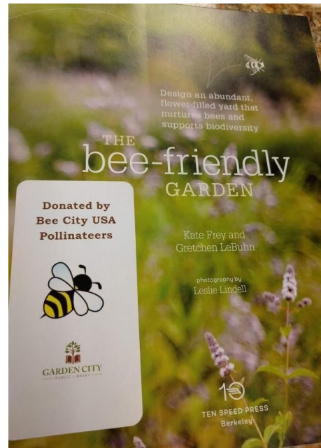
Library Book donation sticker