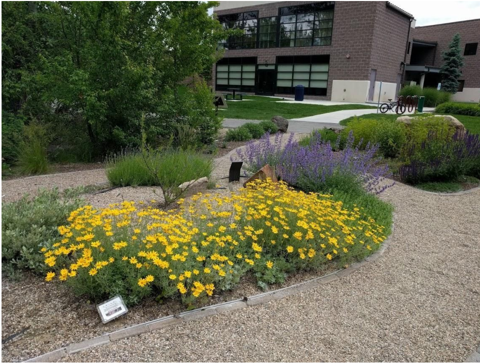
Pollinator Habitat East Side, May 2019