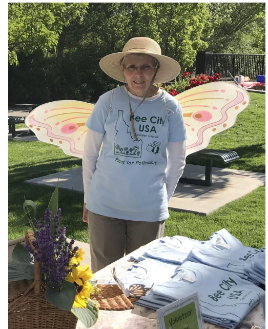
Chinden Gardeners Club booth at Pollinator Celebration

Our 2019 Speaker Series at Garden City City Hall included 5 speakers on various topics concerning pollinator conservation. Experts on wasps, bumble bees, plants, habitat design, and how gardening for birds helps pollinators helped to enlighten over 100 people. The August presentation included a tour of the Pollinator Habitat. The annual Pollinator Celebration hosted 153 people and included pollinator identification walks, 14 vendors, activities for kids, and a film highlighting home, public and farm pollinator gardens. We were highlighted in a local newspaper for influencing the installation of pollinator gardens, and written up in Edible Idaho's fall issue. Both of these publications reach thousands of citizens. We donated $300 to our local library to purchase books about helping pollinators. They put up a display for the month of May with these books and more.