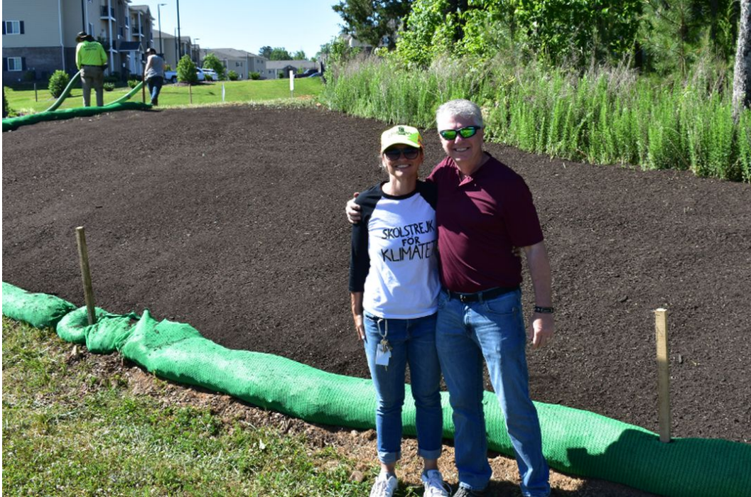
Cates Creek Park receives 10,000 square feet of compost blankets filled with native plant seeds.

Over fifty volunteers were very active throughout the year with eleven workdays in the town's pollinator gardens. The workdays included garden maintenance such as weeding, mulching, planting and pruning. The Town applied compost blankets on the slopes of a local park to control soil erosion and create a no-mow meadow. The no mow slopes comprise 10,00 square feet and were seeded with a native flower and grass mix.