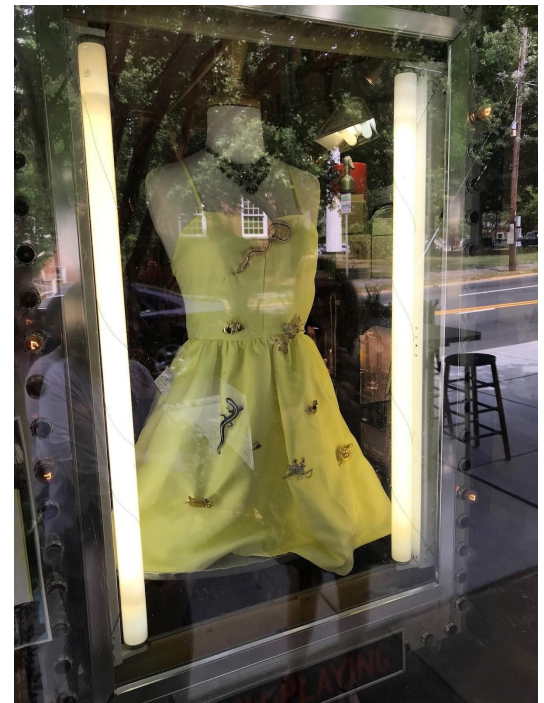
Local vintage jewelry store promotes Pollinator Week with artful display of pollinator insects and other creatures.

The Town of Hillsborough celebrated national pollinator week with a variety of events and overwhelming support from the community. The Bee City subcommittee hosted several lectures and workshops at the Orange County Public Library. The Master Gardeners hosted a program about the importance of pollinators and a local resident and Garden Club member opened her private pollinator garden for a public tour. Downtown merchants also participated with special promotions and pollinator-themed storefront displays. Margaret Lane Art gallery held a special pollinator-related exhibit. The Orange County Historical Museum encouraged creating pollinator gardens at home by distributing packets of native flowering plant seeds.