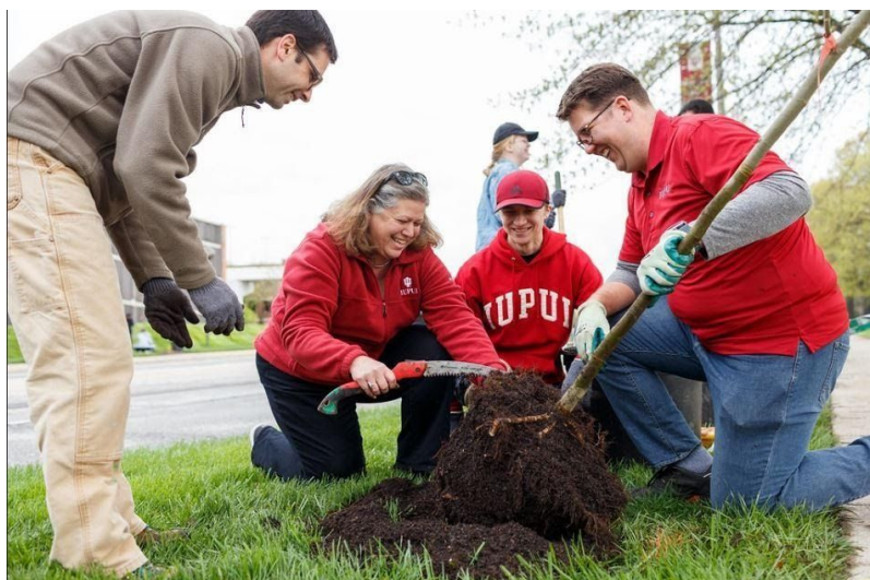
50 Trees for 50 Years