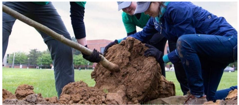
Arbor Day Tree Planting