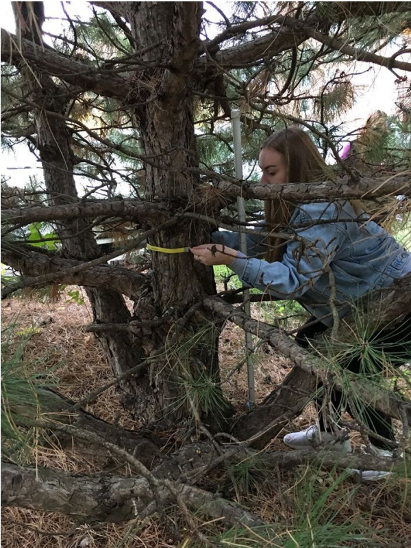
A student taking a DBH measurement of a tree