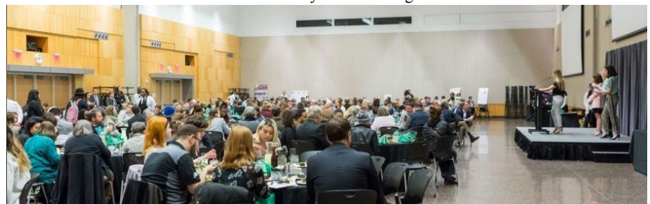
IUPUI Sustainability Conference