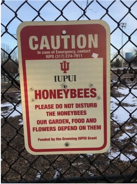
Permanent bee sign that is on display near the campus garden

students, staff, and the community can have for free. The first year was to concentrate on easy to grow herbs, with plans to expand to vegetables, flowers, and other native/ non invasives in the future.