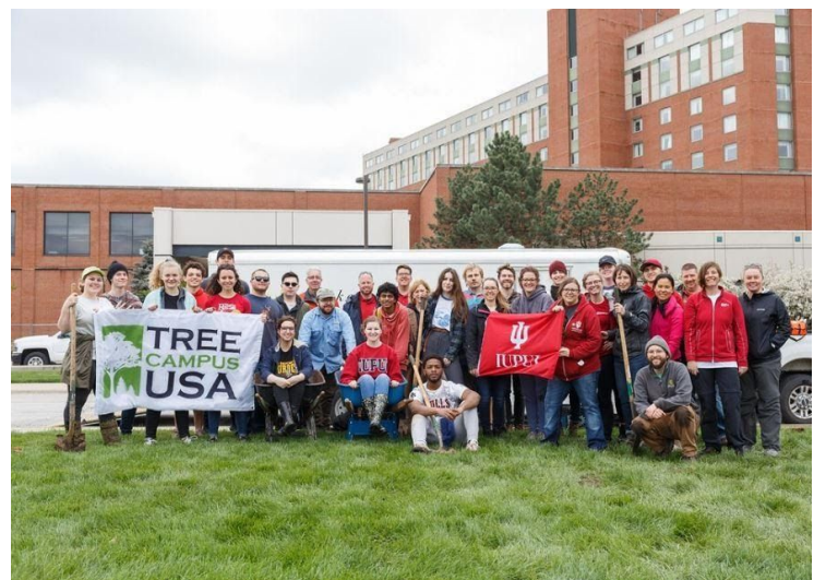
50 Trees for 50 Years

Pollinator Garden Planting - For a IUPUI honors project, the student designed a pollinator garden that was installed near our Riverwalk residence hall through a partnership with Keep Indianapolis Beautiful and 50 Rolls Royce Day of Service volunteers.