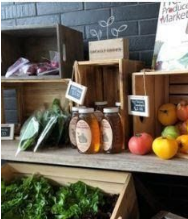
IUPUI Fresh Produce Market