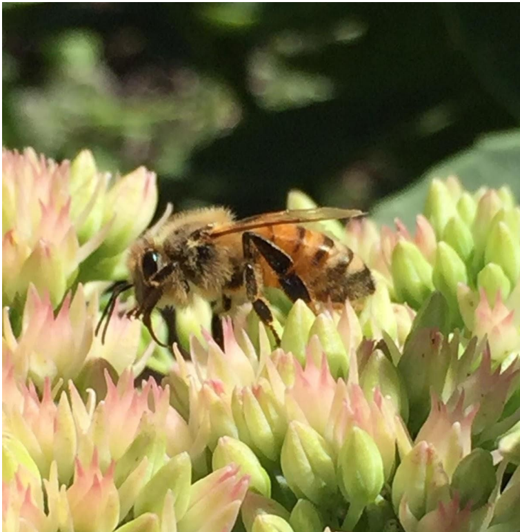
Honeybee in our garden.