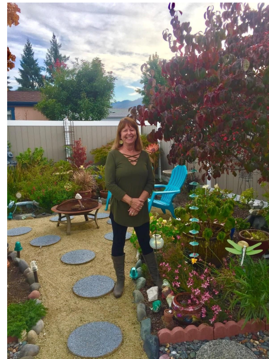
Newly certified Phoenix Garden