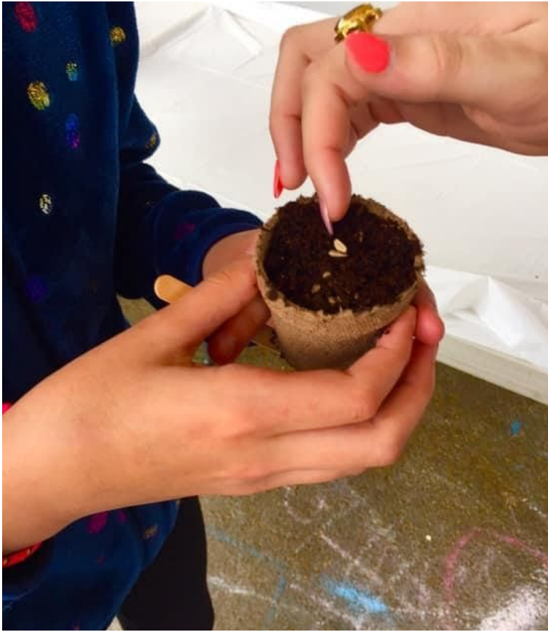
Helping Phoenix Elementary Students plant sunflowers.