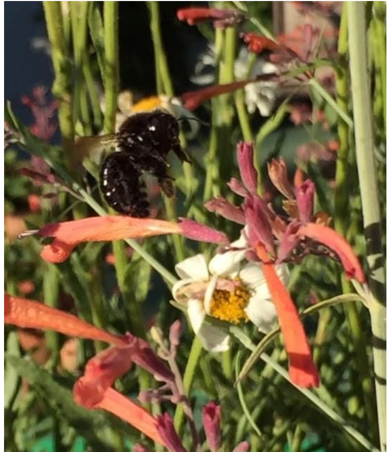
Carpenter bee foraging.