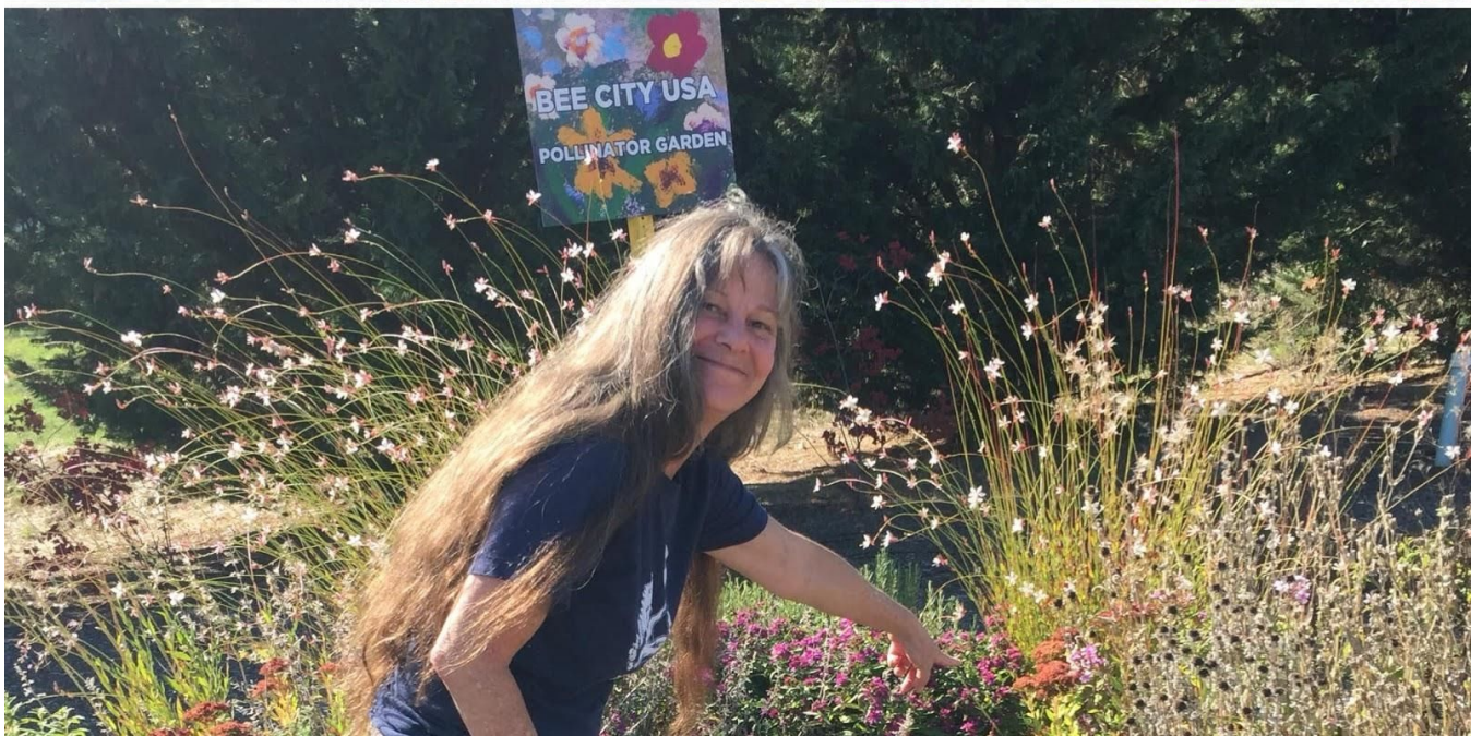
Spring cleanup (which was really winter cleanup/planting)!