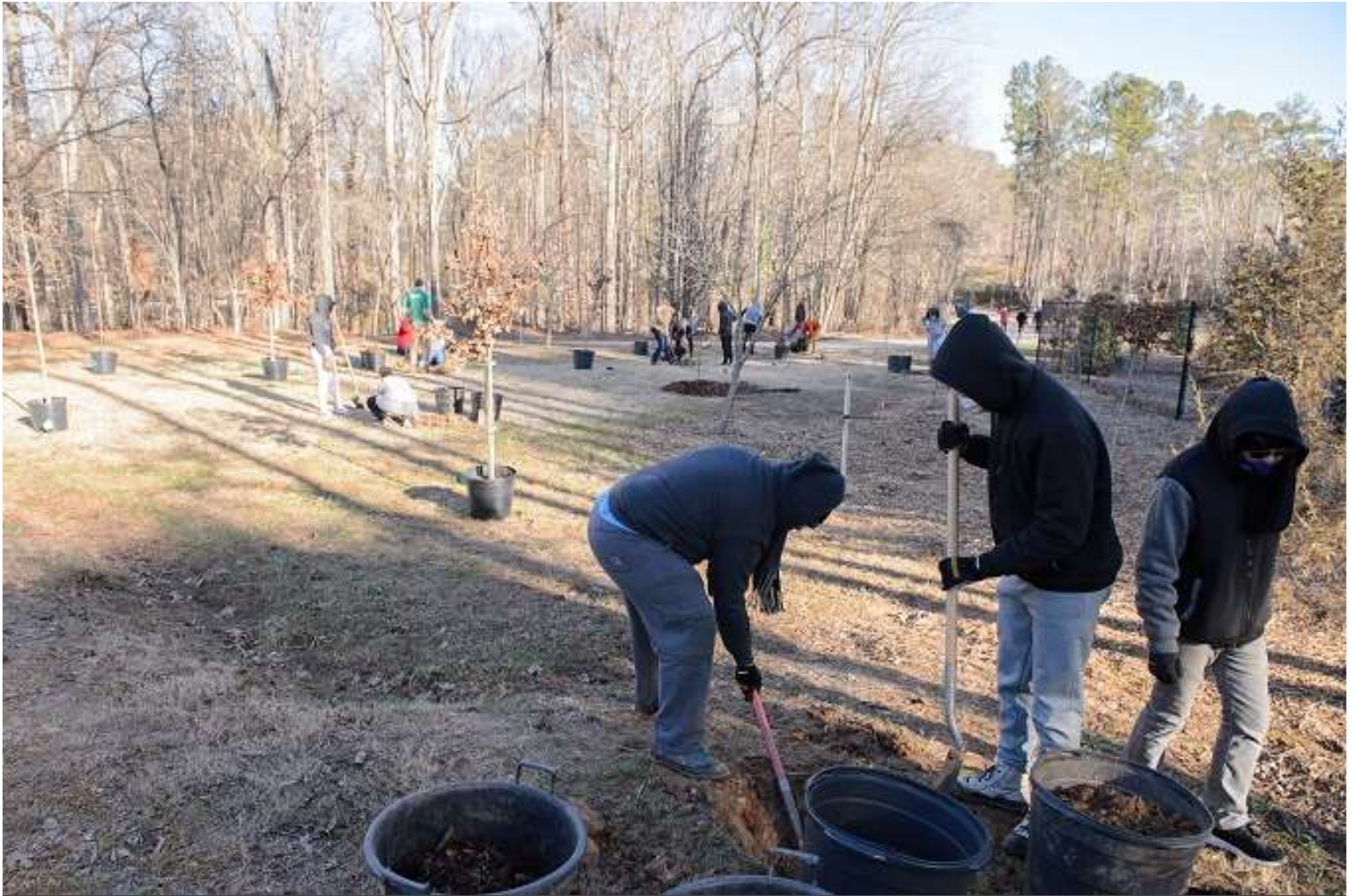
Volunteers planting trees on Martin Luther King Jr. Day.

Members from the committee assisted with two City of Dunwoody events, a Native Tree Planting in Brook Run Park on Martin Luther King Jr. Day and on Arbor Day.