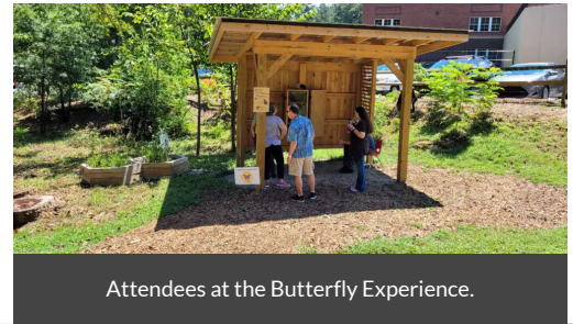
Attendees at the Butterfly Experience.