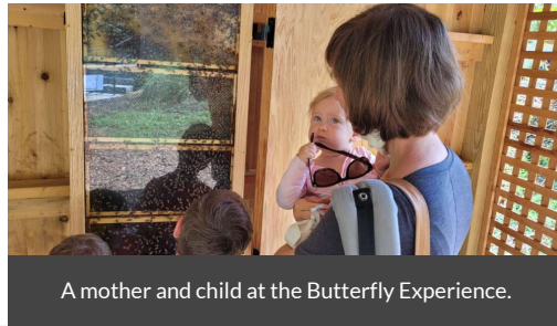
A mother and child at the Butterfly Experience.