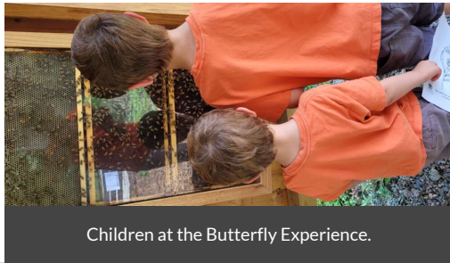
Children at the Butterfly Experience.

The Dunwoody Nature Center hosted the annual Butterfly Experience, which was spread across multiple days from August 19 to August 22. The Butterfly Experience provided activities, crafts, and educational experiences centered around butterflies for all ages. Members of Bee Dunwoody were present.