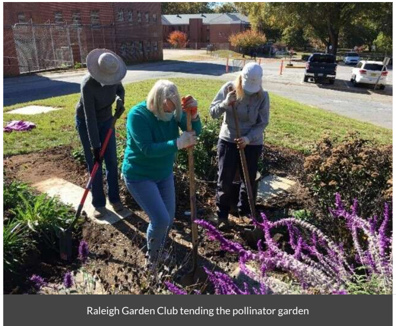
Raleigh Garden Club tending the pollinator garden