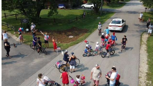
Annual Bike Parade launches in front of newly created pollinator-friendly vegetative swale.