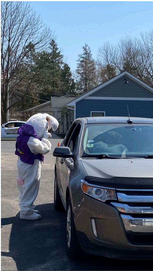
Port Barrington's Bunny shares goodie bags including flowering plant seed packets labeled "BEE the Change"