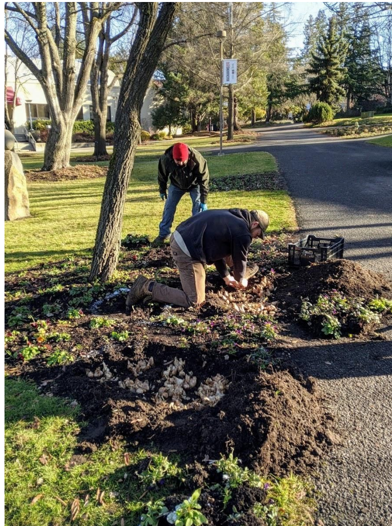
Daffodil plantings, part of a larger pollinator conversion after a lawn removal

Arbor Day Celebration 4/19/2019. 100+ participants: installed 25 flowering trees, rehabilitated pollinator gardens in low-traffic areas.