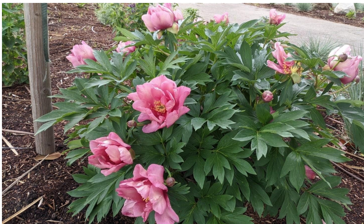
Pollinator Garden Installation, area 3