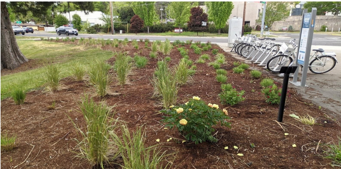
Pollinator Garden Installation, area 1