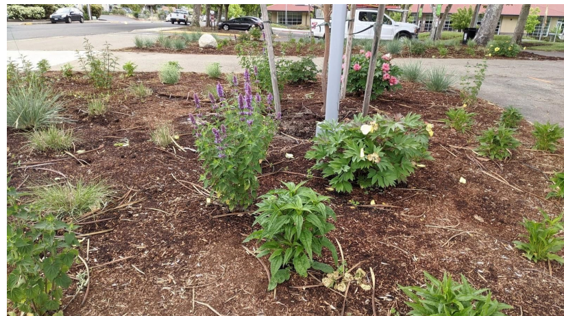
Pollinator Garden Installation, area 3