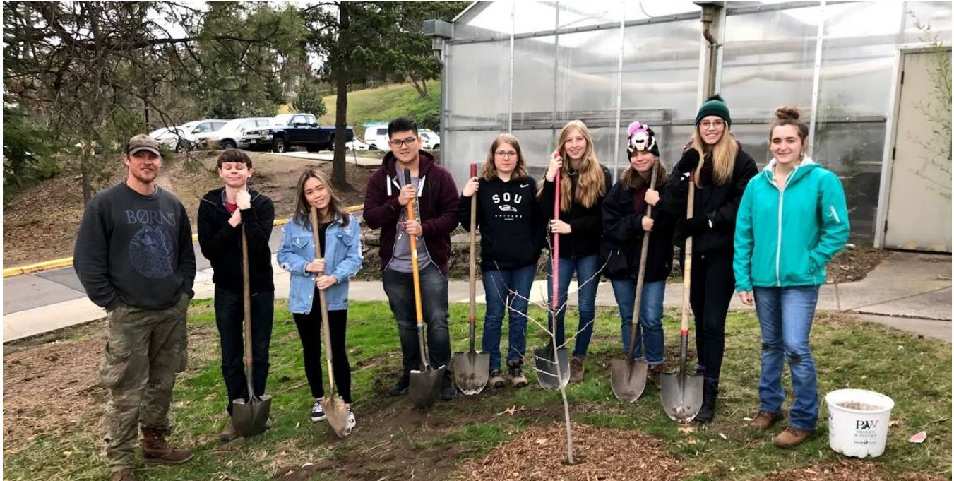
Students installed many flowering trees during various Environmental Science classes - in this photo, a Magnolia × soulangean

March 2019: Student Capstone: Large Commuter Parking Lot Stormwater Detention Pond - 3 students