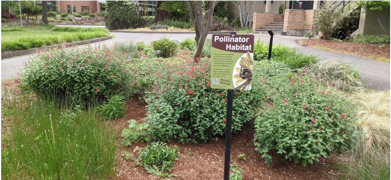
SOU loves bees!!!

Pollinator habitat sign on new garden, permanent.