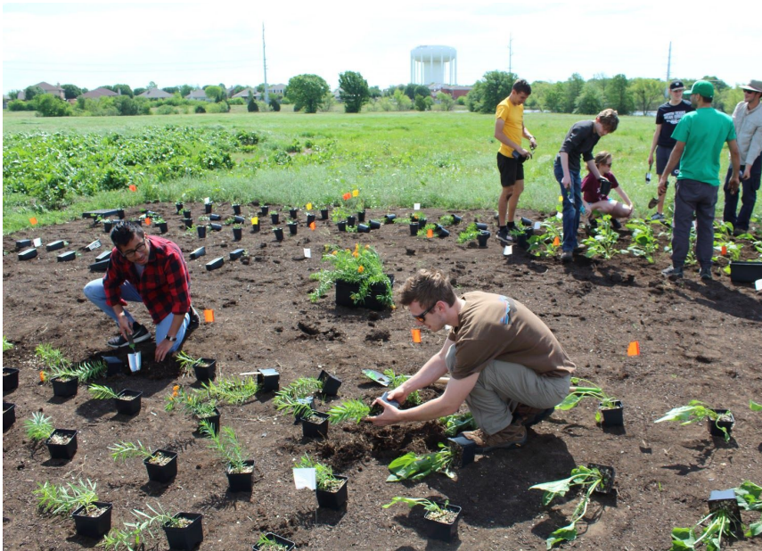
With helping hands, hundreds of students helped enhance the Pollinative Prairie at Discovery Park by planting over 8,000 Texas native plants in the span of one week.