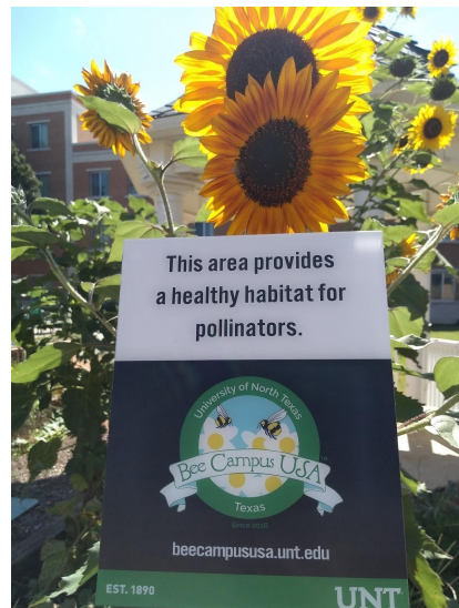
The UNT Community Garden is one of many pollinator sanctuaries on campus that provides quality habitat for vital pollinator species. Other sanctuaries on campus are also indicated with new educational awareness signage.