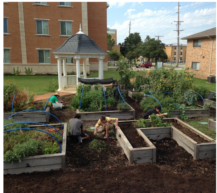
Members of the UNT Community Garden experimented with a chemical-free method for maintaining weeds in the garden pathways by layering cardboard beneath mulch. This pollinator protection project was expanded after seeing the impressive results when comparing areas that did and did not receive the weed barrier treatment.