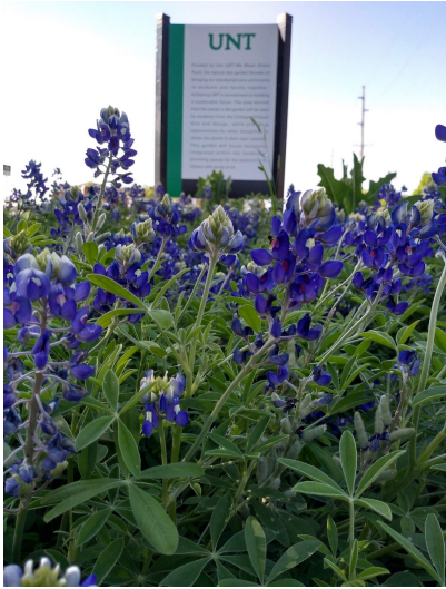
Pockets of campus explode with Texas bluebonnets ( Lupinus texensis ) in the springtime inviting pollinators to buzz about.