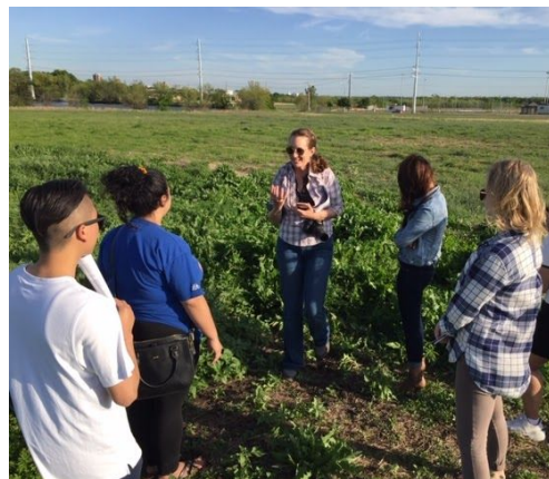
The Pollinative Prairie, a North Central Texas tallgrass prairie reconstruction project, hosts many visitors throughout the year to broaden education about the importance of creating larger islands of pollinator habitat.