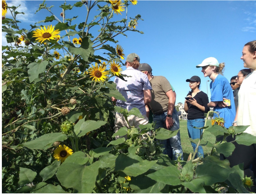
Students enrolled in an Environmental Science laboratory for non-majors explore the Pollinative Prairie through a bio-blitz exercise to document pollinator species they find buzzing through the prairie habitat using a citizen scientist app.