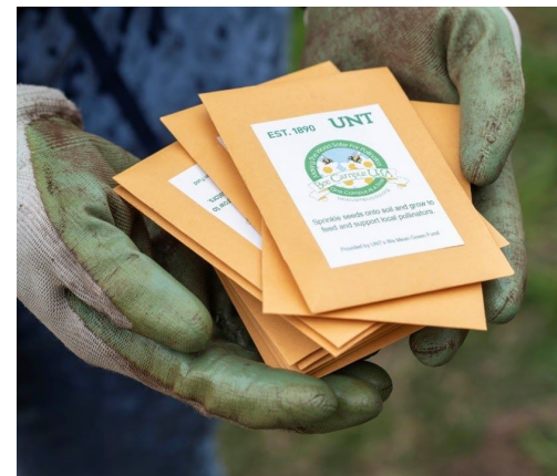
Sharing native wildflower seed packets is a great way to help feed and support local pollinators!