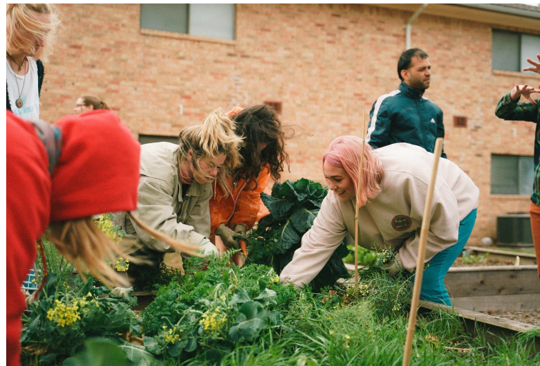
Students harvest broccoli and carrots at the UNT Community Garden while learning how to attract pollinators to their garden plots during a pollinator-themed gardening workshop.

To promote pollinator health and habitat, the Pollinative Prairie was expanded by seeding additional acreage of North Central Texas tallgrass prairie species after removing invasive Bermuda grass. This process was done over multiple workdays in coordination with the UNT Ecology and Philosophy Departments and the Society for Ecological Restoration student organization. Additionally, the Community Garden and Natural Dye Garden both received continued enhancement through planting native wildflower species and creating diverse pollinator habitat types. Both sanctuaries were registered as Monarch Waystations and have been supported by students, staff, and faculty over several workdays. The Community Garden installed two fruit trees including a fig tree and a pomegranate tree to provide pollinator habitat. The Facilities Department additionally hosted a handful of special campus