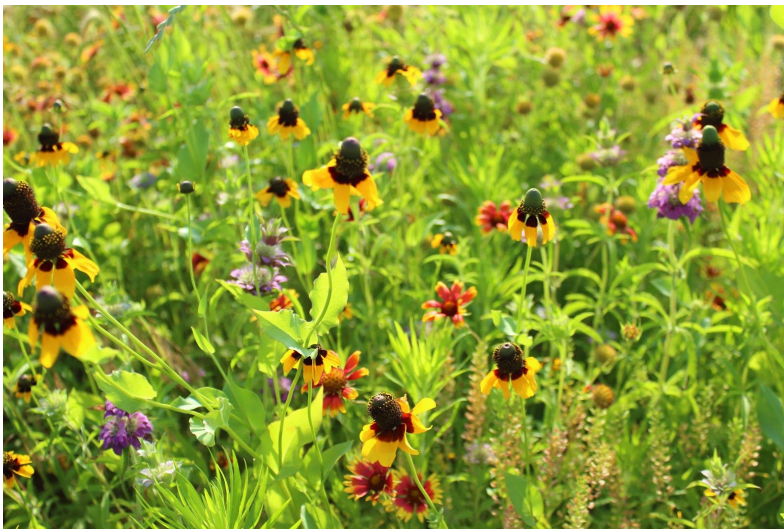
In the midst of summer, a field of wildflowers at the Pollinative Prairie provides a healthy native habitat for birds, insects, and animals of all kinds.