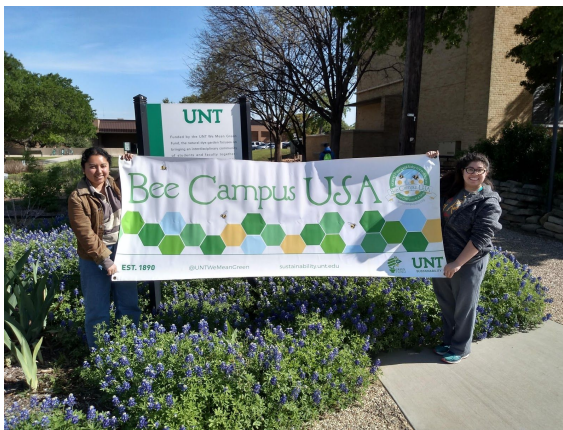
Students who care for the UNT Natural Dye Garden are greeted in the spring by a happy patch of Texas bluebonnet wildflowers. We proudly display the Bee Campus USA banner!