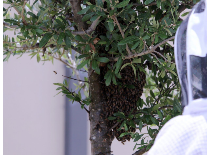
With assistance from professionals of the Denton County Beekeepers Association, a swarm of European Honeybees was relocated to a safer location away from a campus pedestrian sidewalk.