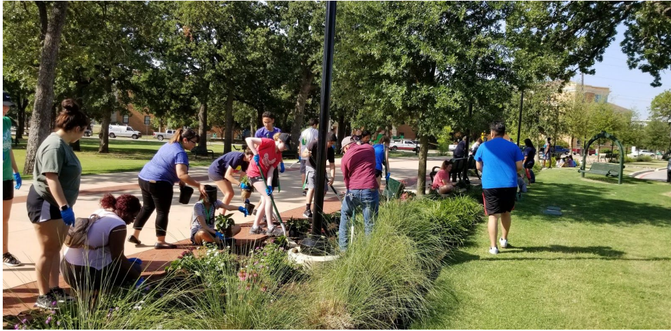
During a summer service-learning project, student teams planted hundreds of pollinator-attracting perennials in Clark Park to be enjoyed by pollinators and students year after year.