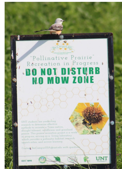
A scissor-tailed flycatcher ( Tyrannus forficatus ), also known as the Texas bird-of-paradise, perches in safety at the Pecan Creek Pollinative Prairie no mow zone.

In 2019, UNT installed 19 educational outdoor signs to identify healthy pollinator habitats found across campus and spread awareness about our Bee Campus USA efforts. We continue to display our Bee Campus USA banner at volunteer events and also have a no mow sign posted at the Pollinative Prairie.