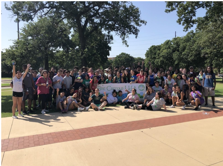
Nearly eighty students proudly showcase the UNT Bee Campus USA banner to celebrate their volunteer efforts after planting over 300 pollinator-friendly plant species including Echinacea, Rudbeckia, Salvia, and Scabiosa varieties.