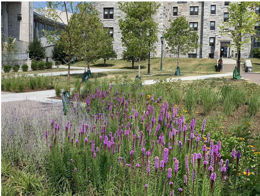
After construction was completed on the UVM Medical Center, the staging area for construction equipment was landscaped to include a new pollinator-friendly “pocket garden”.