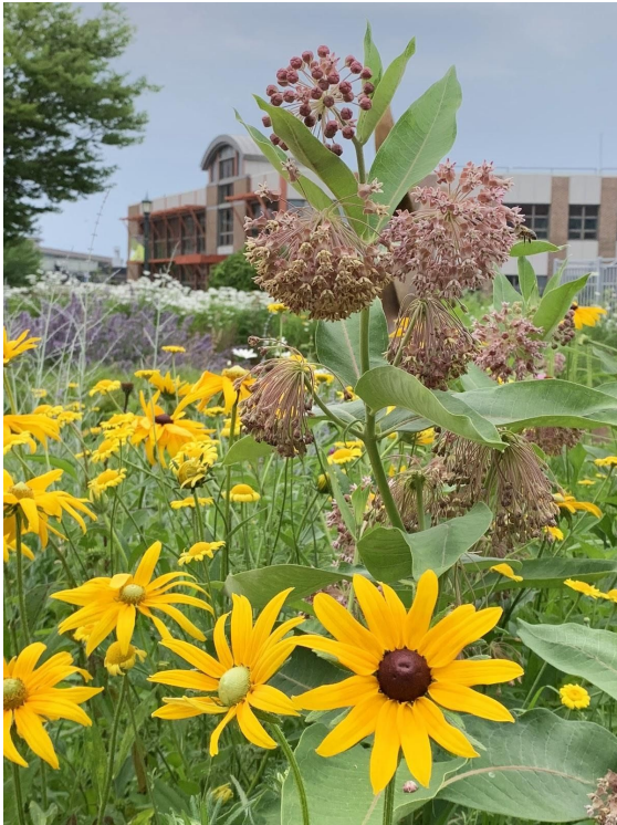
Milkweed plants were added to many of the pollinator “pocket gardens” on campus..

season blooming native plants to improve the biodiversity of plant species and thus pollinator species on and around campus. The latest endeavor on campus was the installation of a new pollinator-friendly garden on a site used for staging of construction equipment for a new wing of the UVM Medical Center.