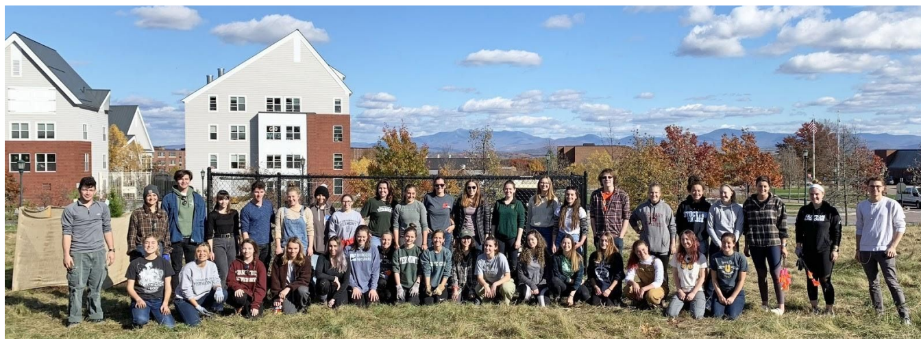
The UVM Beekeepers Club and the UVM Horticulture Club joined forces to plant native and dry-upland pollinator-friendly perennials in the meadow adjacent to the apiary on campus.

May-September - Installation and maintenance of pollinator "pocket gardens" around Jeffords Hall on campus by the UVM Horticulture Club, UVM Beekeepers, summer gardening interns and Vermont Master Gardeners. These pocket gardens included many native plants to enhance bee and butterfly pollinator food sources on campus. Also planted for the first time were "pollinator strips" that included native, pollinator-friendly plants adjacent to the managed crop areas at the UVM Horticulture Research and Education Center ( http://www.uvm.edu/~hortfarm/ ).