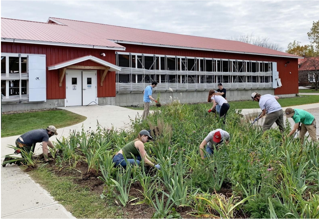
Students in the Home and Garden Horticulture Lab removing weeds and planted additional pollinator-friendly perennials.