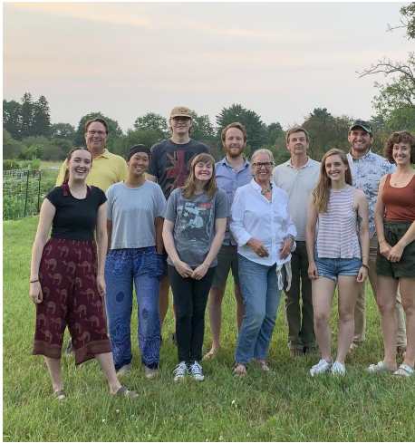
A mix of matriculated and Continuing Education students made up the first beekeeping class at the University of Vermont in 40 years.