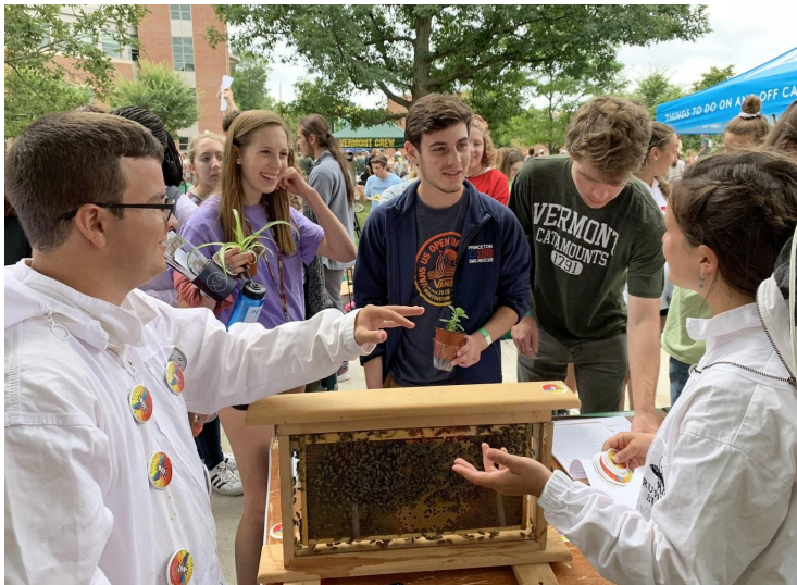
The University of Vermont Beekeeping Club put an observation hive on display at the First Year Student Picnic and Club Fair to recruit new members.