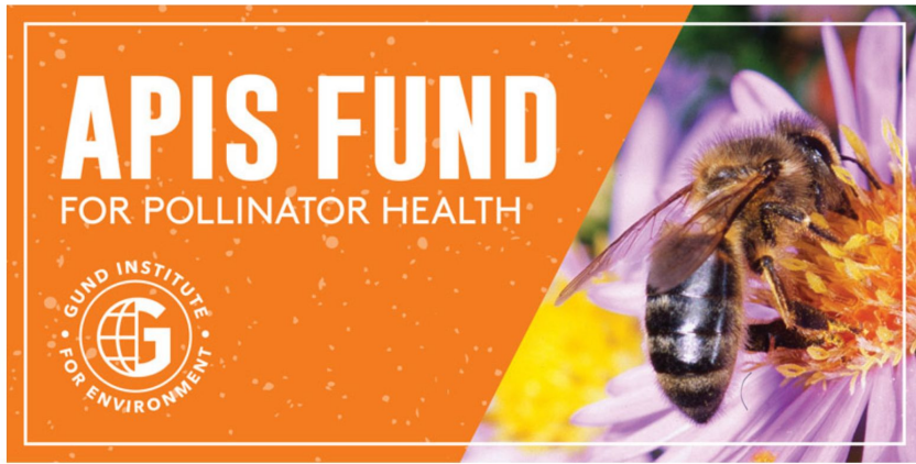
A $500K gift to The University of Vermont (UVM) established this fund to protect and study pollinators.