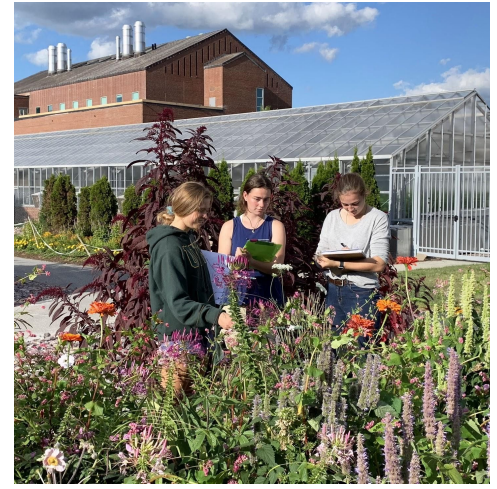
Biology class using the pollinators gardens for one of their lab activities monitoring for pollinators.