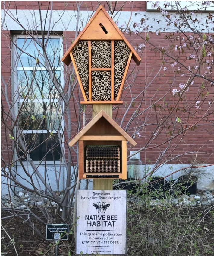
This sign indicates the nesting "houses" suitable for native, solitary bees.