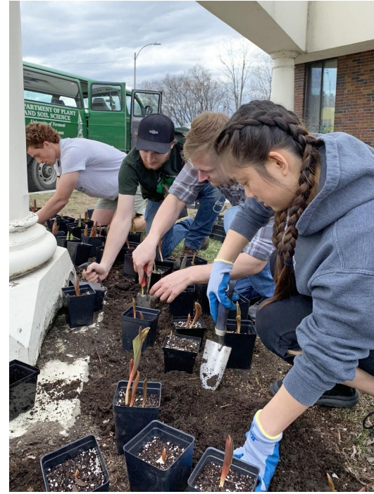
Students in the UVM Horticulture Club planted the beds at the Burlington Police Station with an assortment of bulbs.