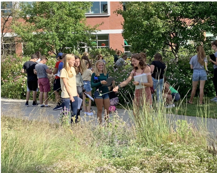
BioCORE students taking counts of pollinator species in the gardens outside of Jeffords Hall.