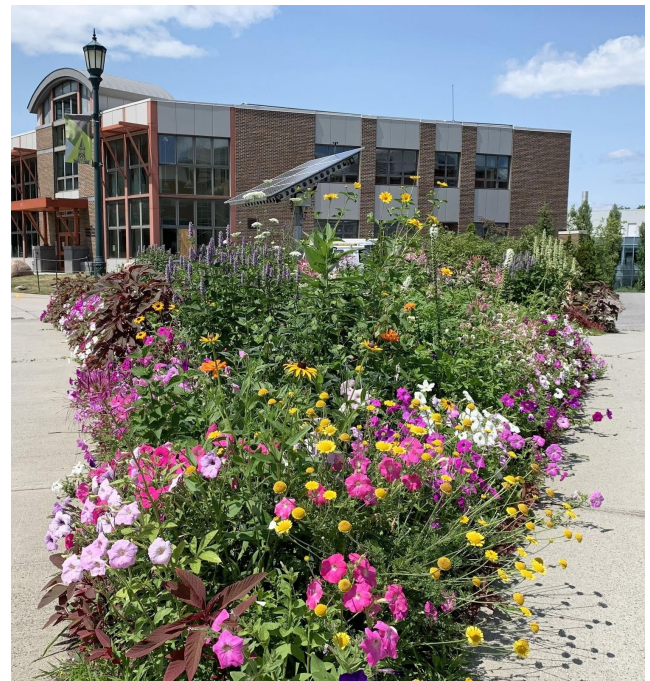
A new pollinator “pocket garden” was added to the area near the Rubenstein School of the Environment and Natural Resources.