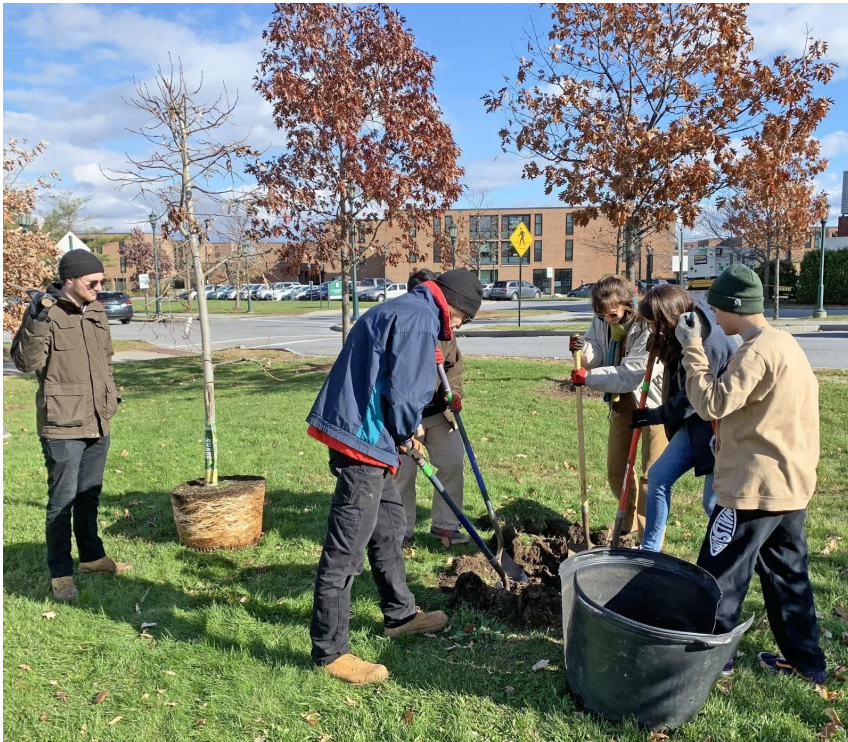
Students in the Home and Garden Horticulture Lab planting an American Basswood tree on main campus.